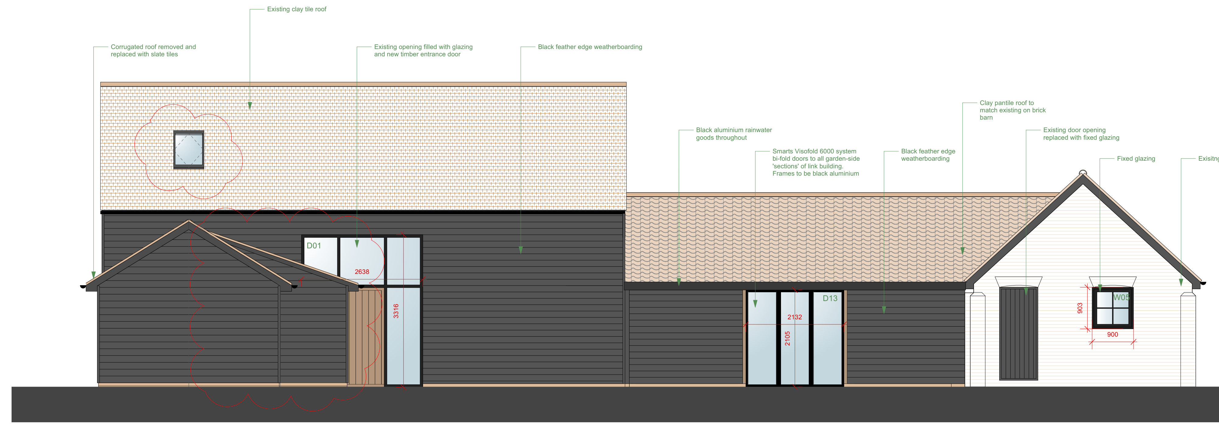
1 North Elevation Scale: 1:50