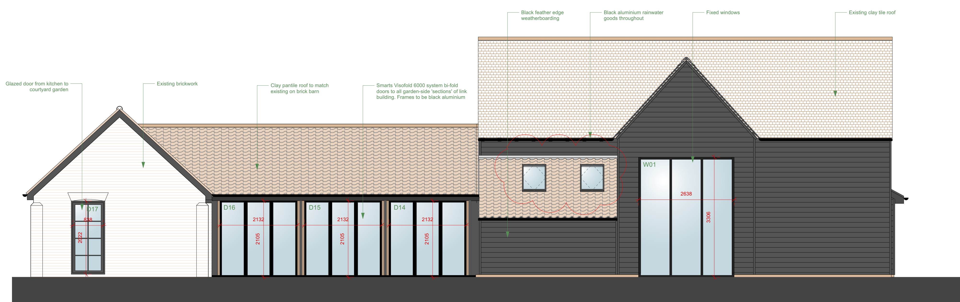
2 South Elevation Scale: 1:50