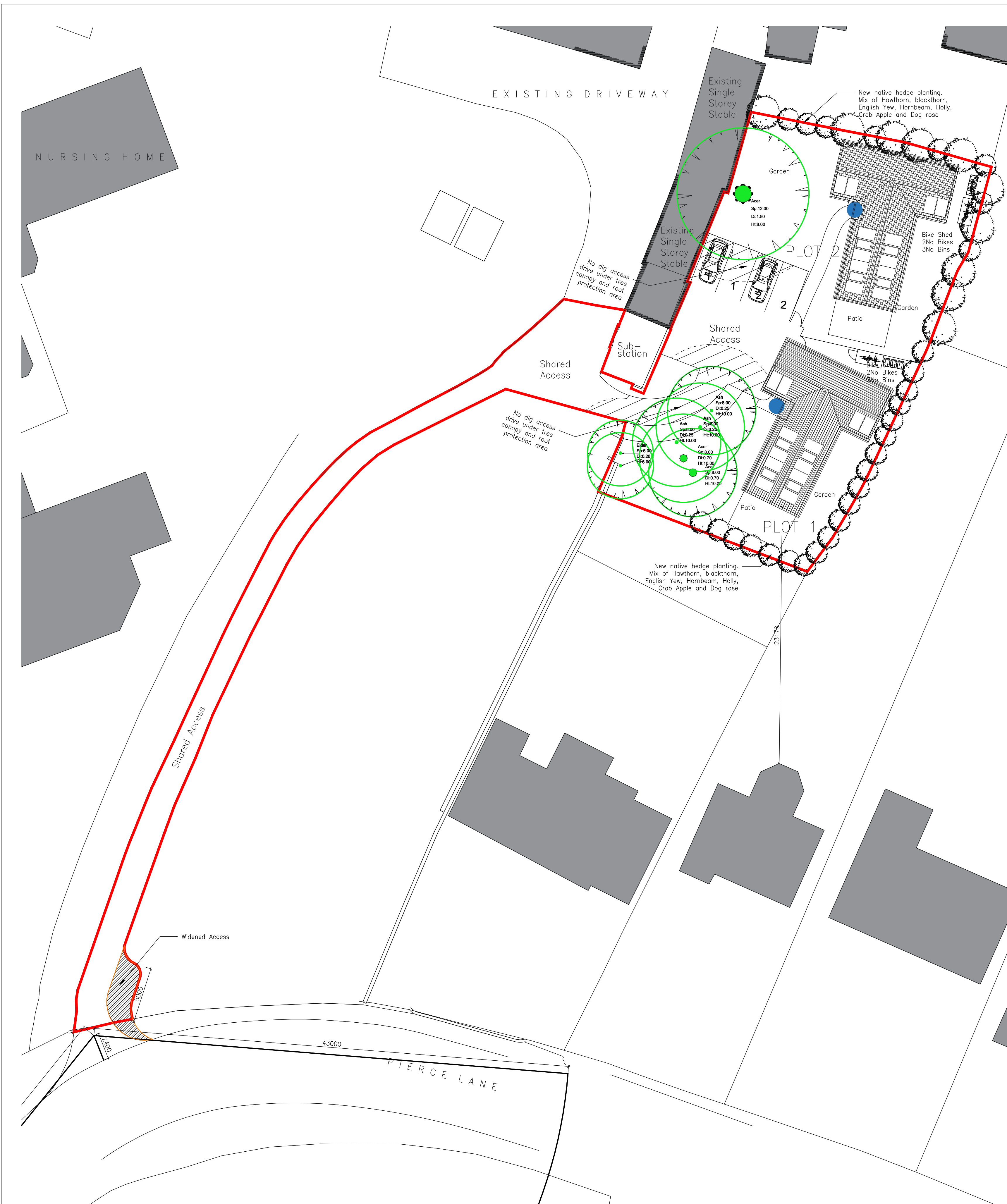
Proposed Block Plan Scale 1:200