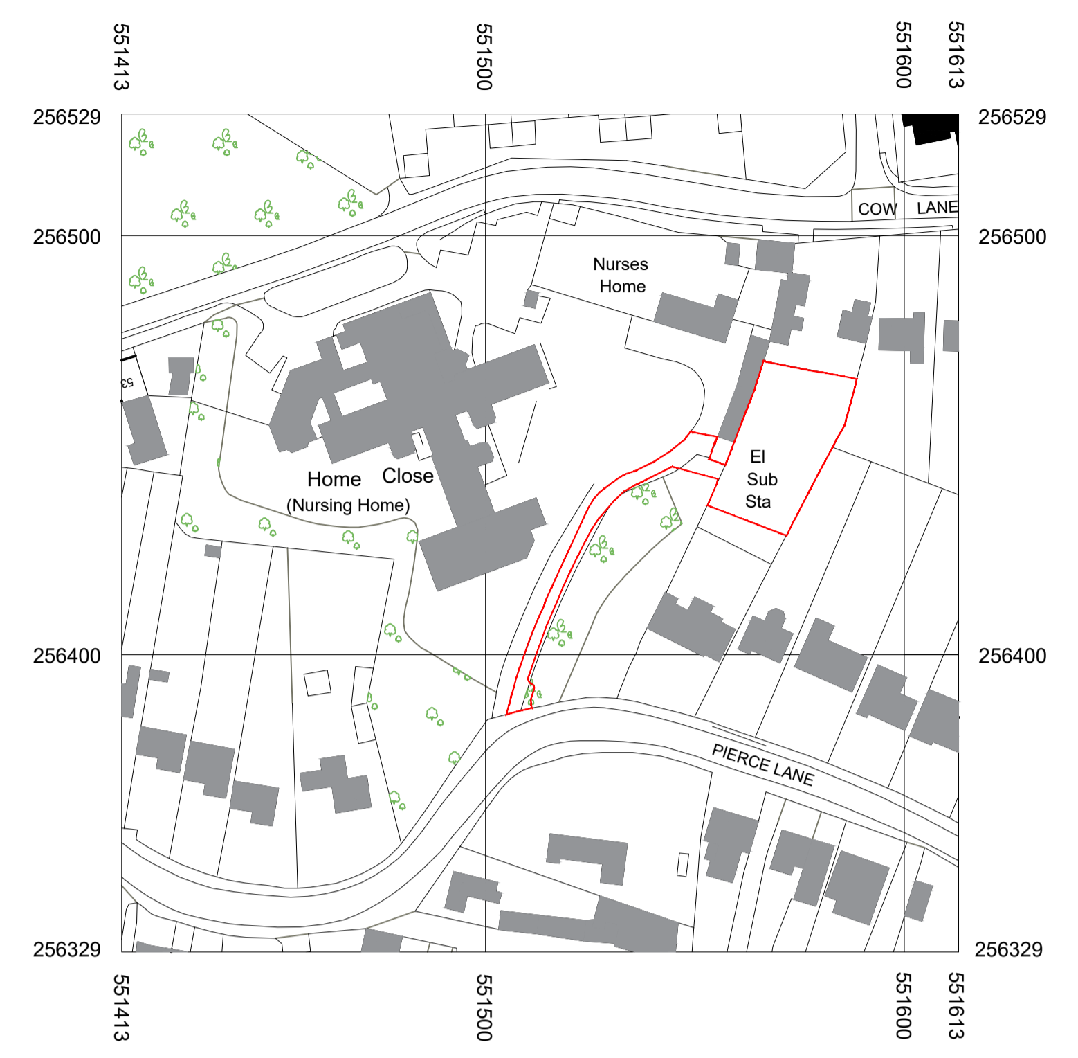
Location Plan Scale 1:1250 Reproduction in whole or in part is prohibited without the permission of Ordnance Survey.