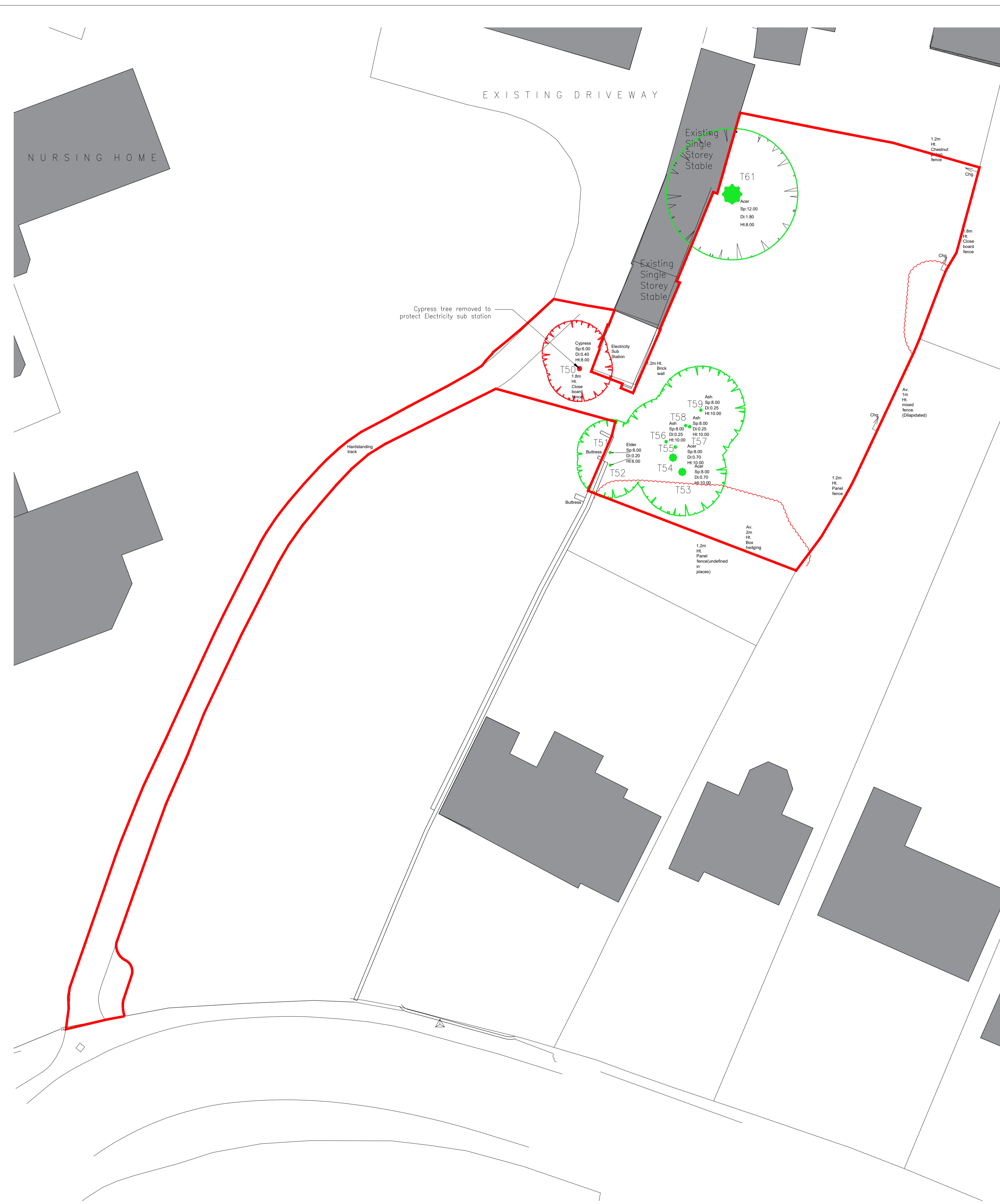
Existing Block Plan Scale 1:200