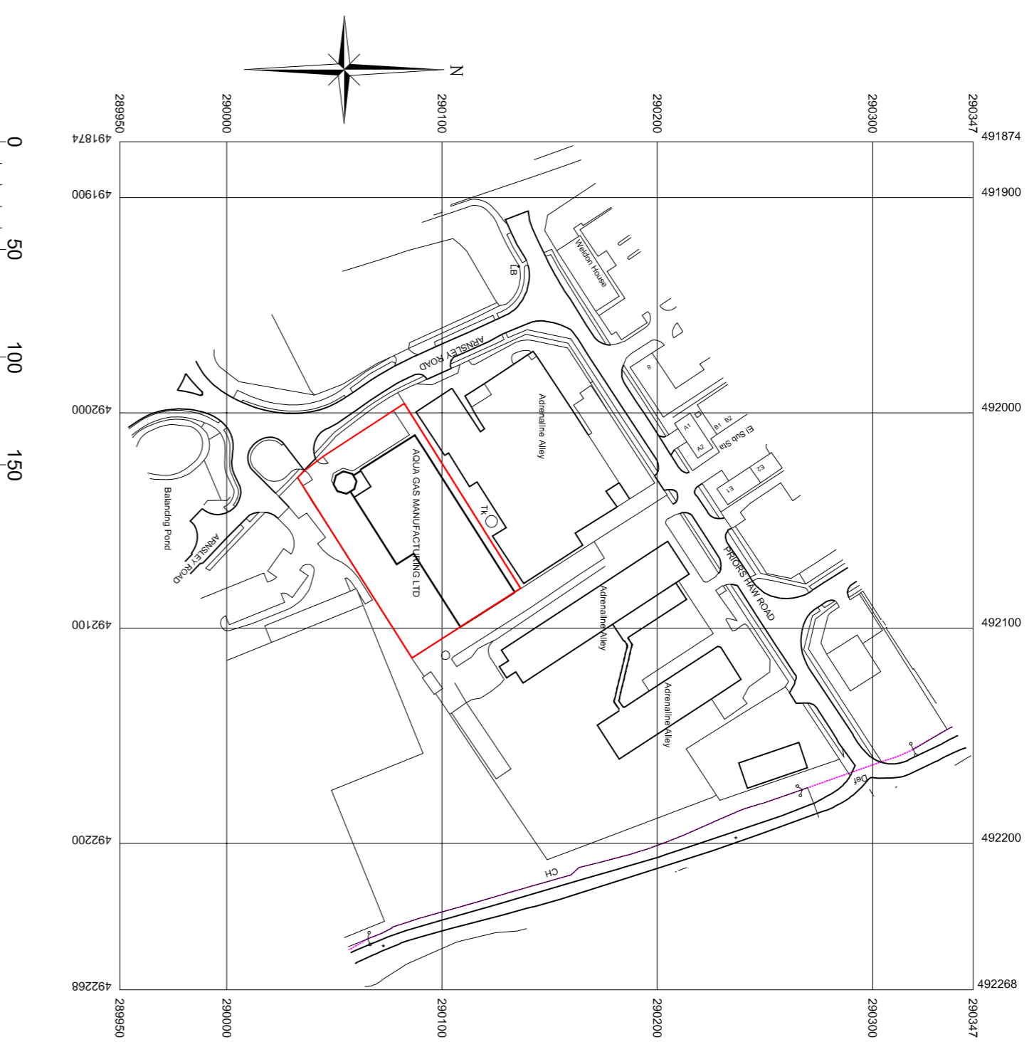
Site Location plan (1:2500)