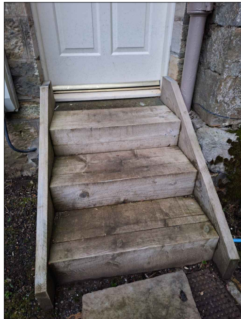
PHOTOGRAPHS OF EXISTING TIMBER STEPS