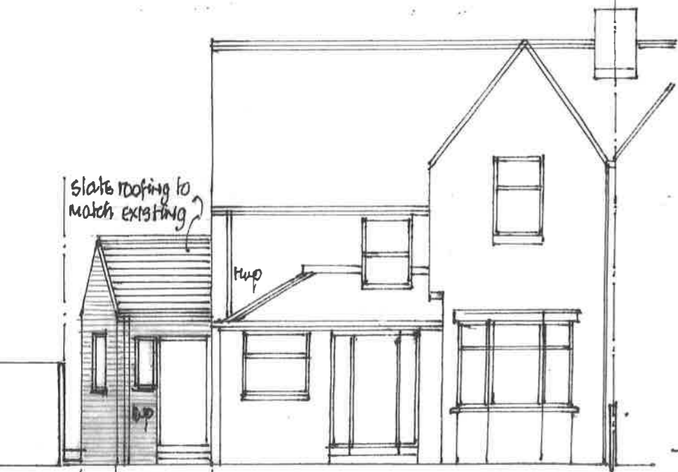
NORTH EAST ELEVATION PROPOSED