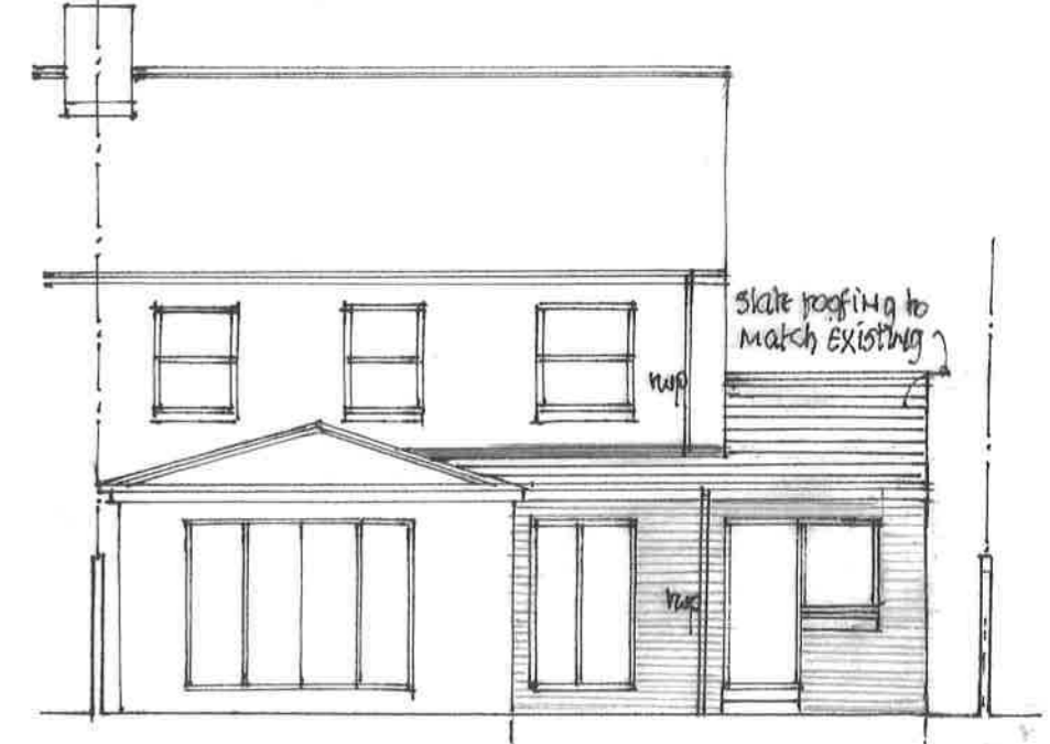
SOUTH WEST ELEVATION PROPOSED