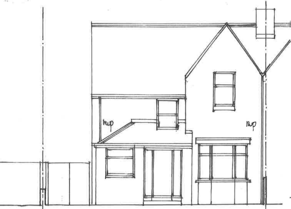
NORTH EAST ELEVATION EXISTING