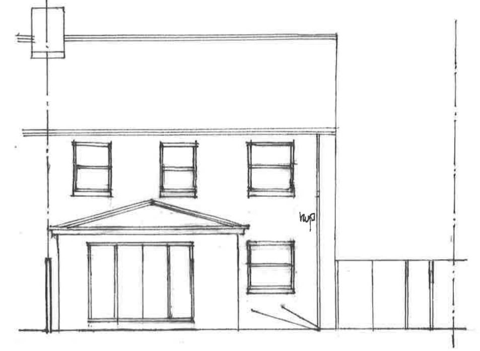
SOUTH WEST ELEVATION EXISTING