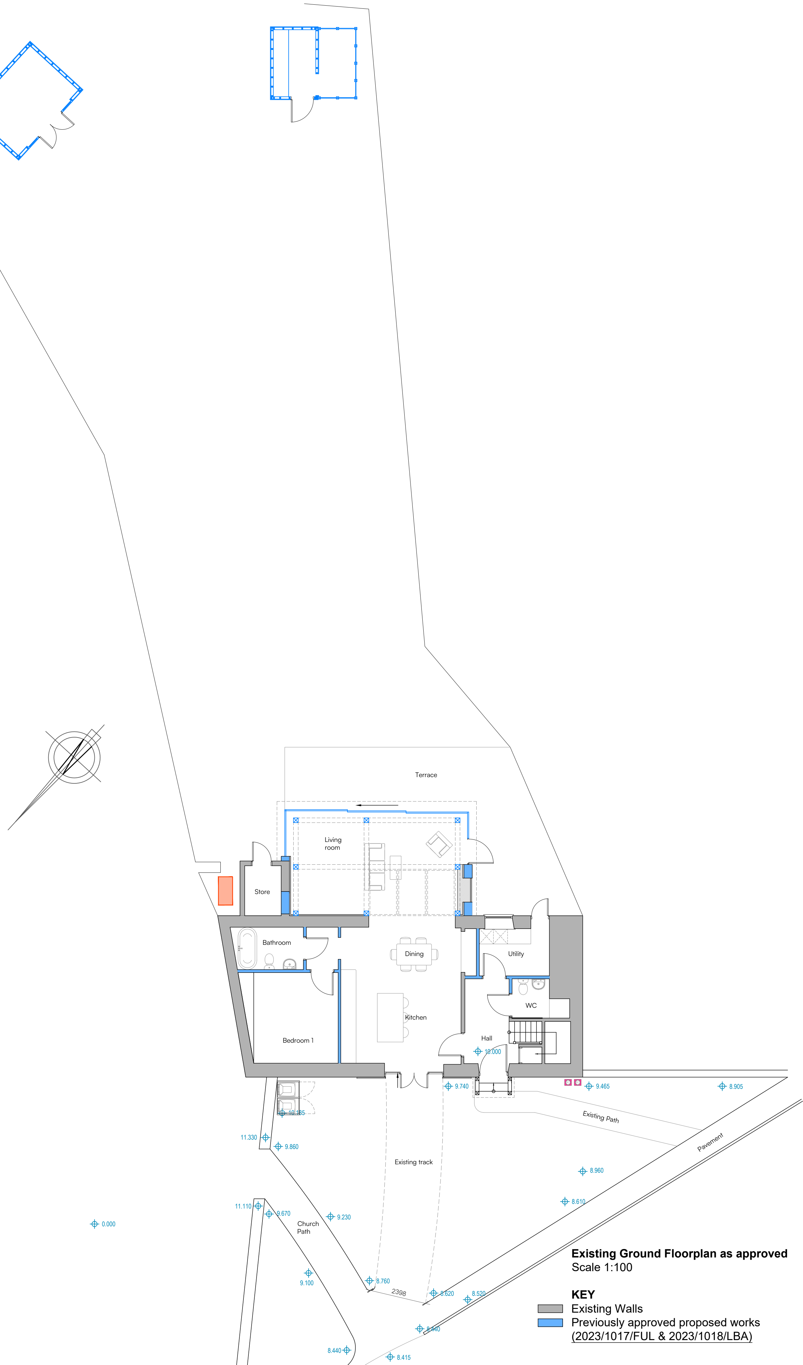
Existing Ground Floorplan as approved Scale 1:100