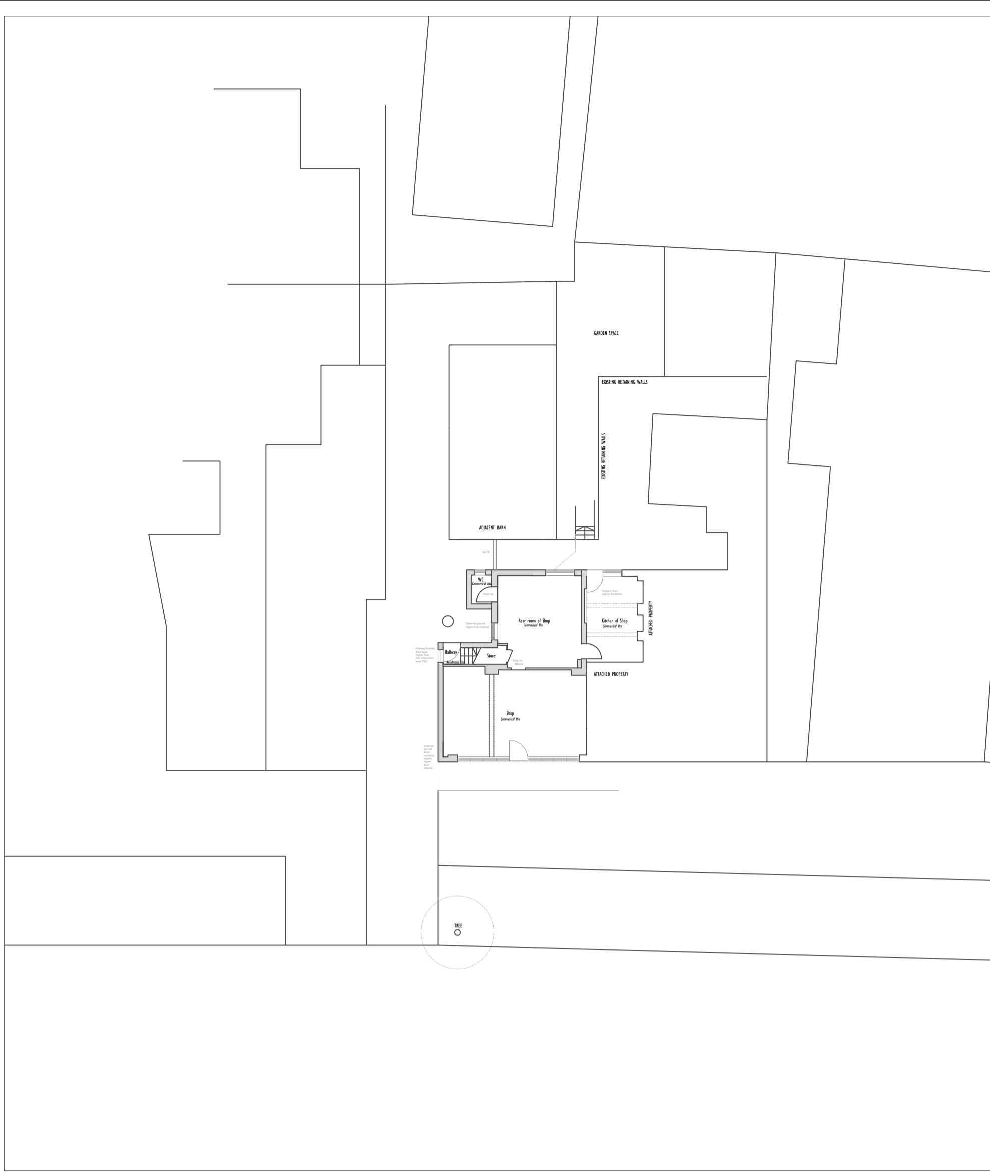
Site Plan (1:200)

Community Infrastructure Levy Forms to be completed and confirmation received from council prior to commencement that all required information has been received. If these forms are not completed prior to commencement then the Levy will become due and no relief will be possible.