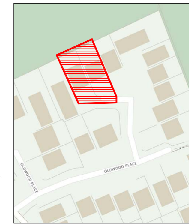
OS REPRODUCED UNDER LICENSE NUMBER - 100054476 SCALE 1:1250