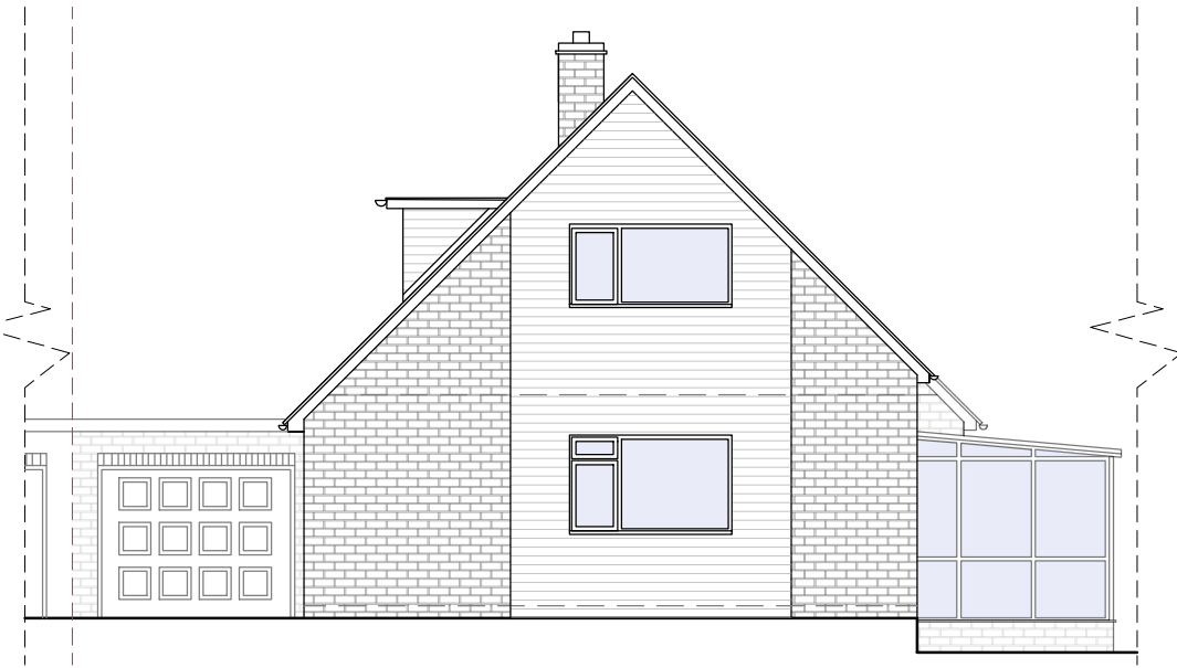
Existing West Elevation