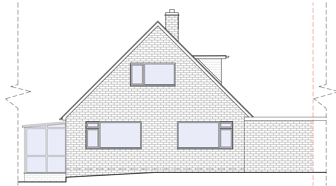
Existing East Elevation

Any dimensions shown should be checked on site and discrepancies reported to the Architect prior to construction. Designs are not coordinated with engineer projects. Do not scale for construction purposes.