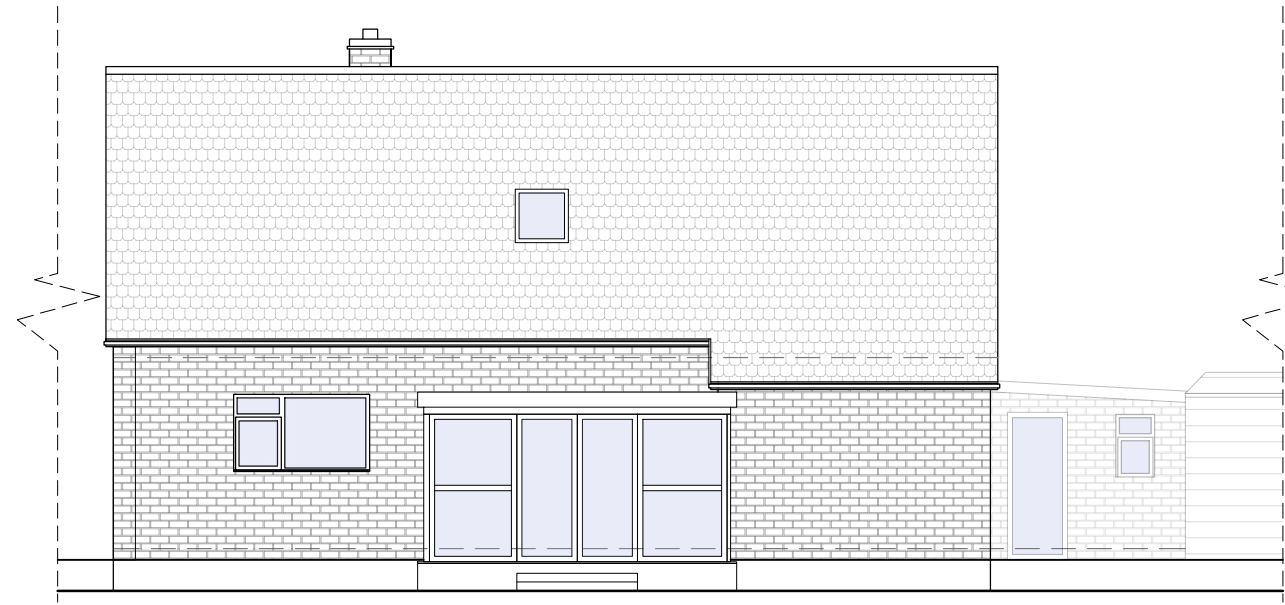
Existing South Elevation