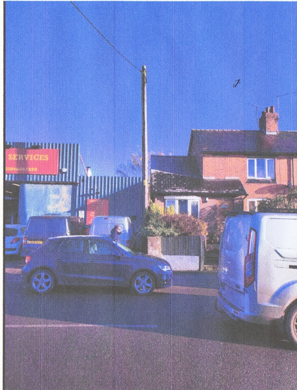
View from Rosemary Lane