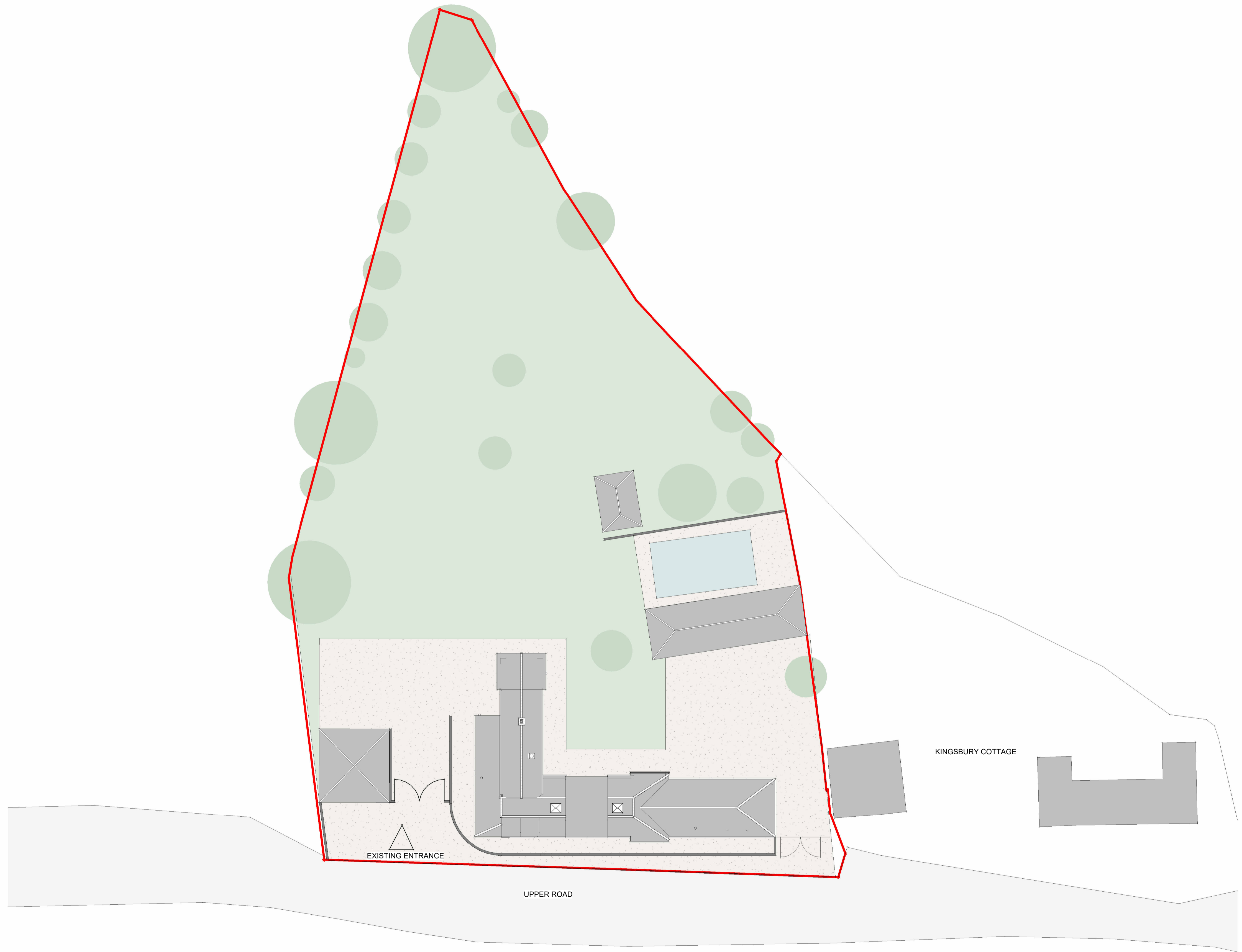
Block Plan as Proposed 1:200