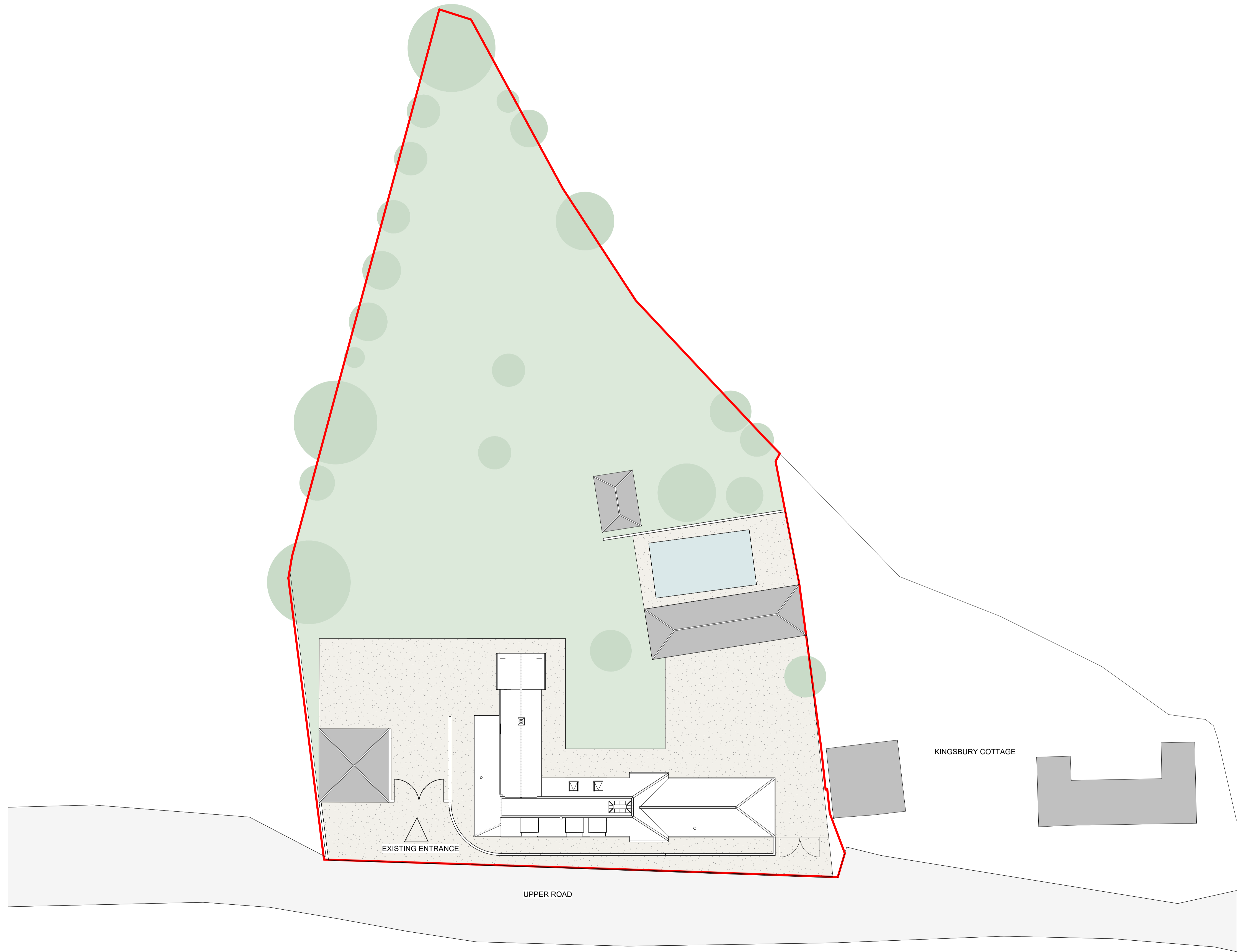
Block Plan as Existing 1:200