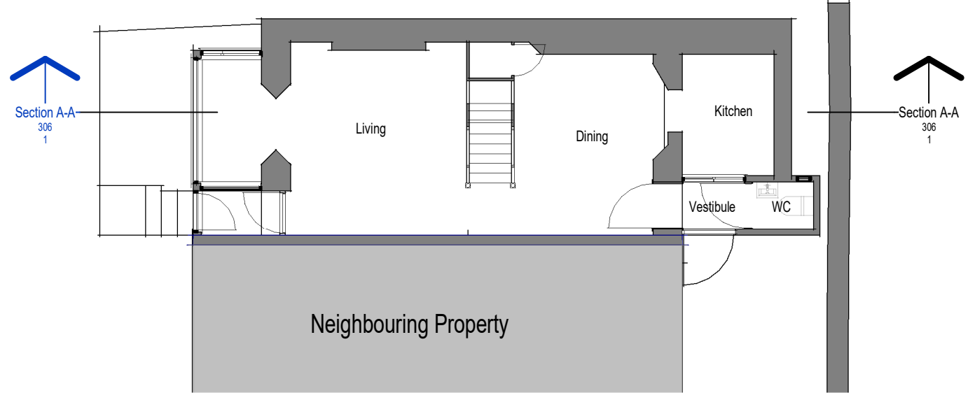
1 Ground Floor 1 : 100