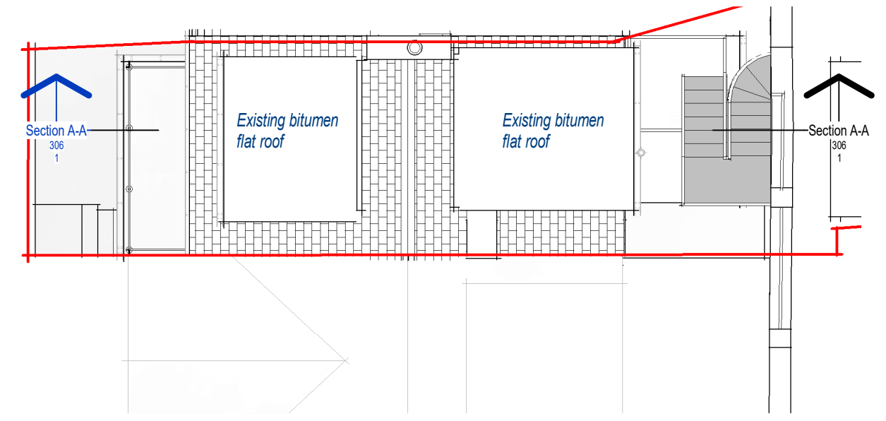
4 Roof Plan 1 : 100