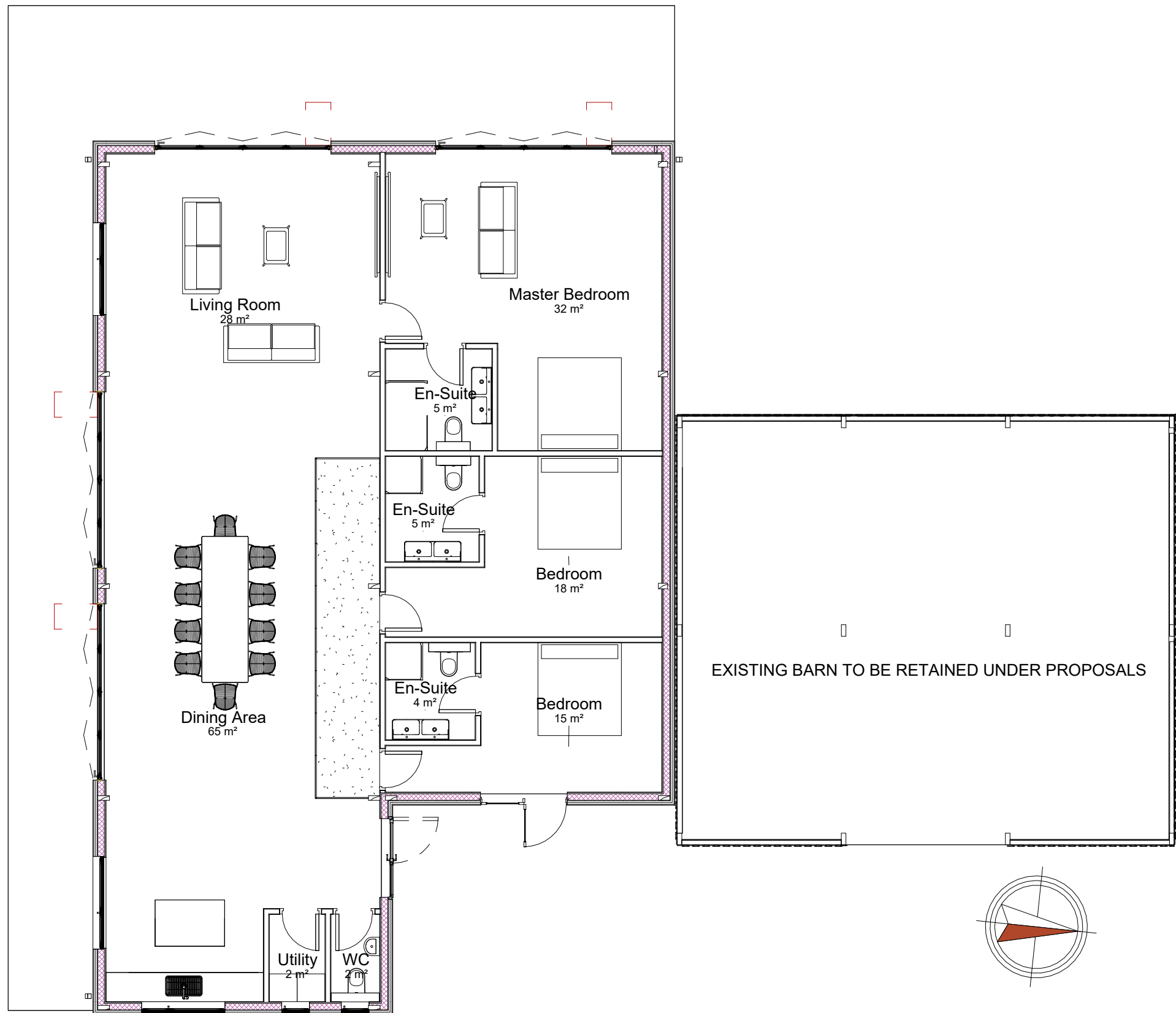
Proposed Ground Floor 1 : 100