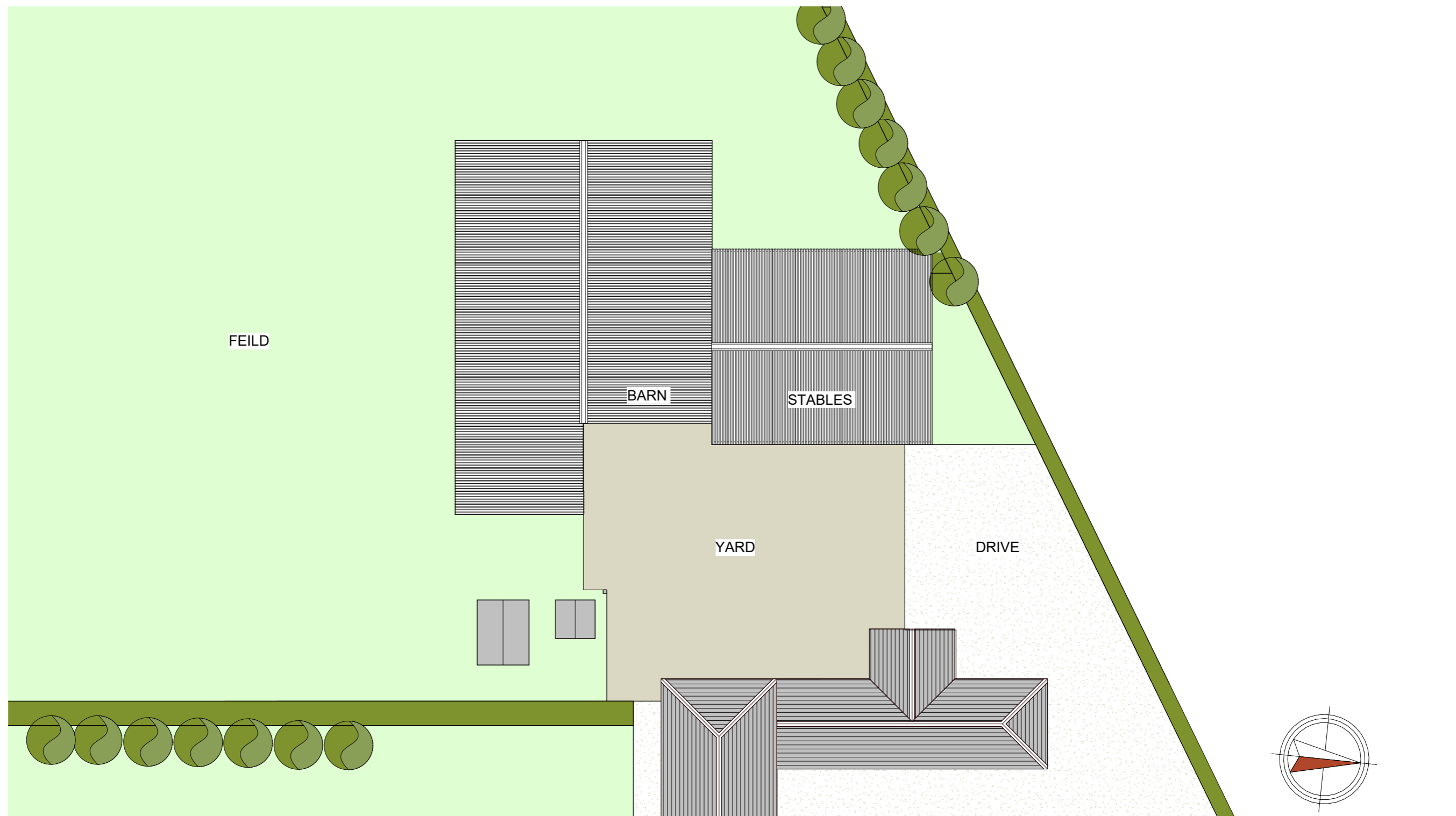
Existing Site Plan 1 : 200