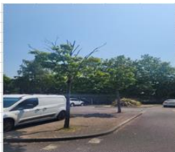
2 x fell to ground and stump grind