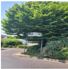
1m Clearance around exit sign