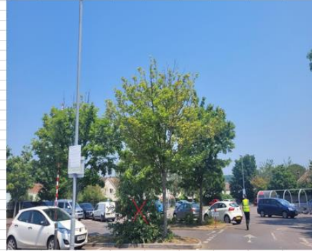
2 x self set trees to be felled to ground and stump grinded