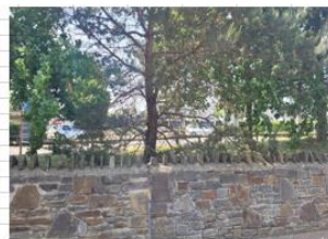
2 x Pines to be crowned lifted to 3m from ground