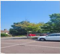
Dead wooding required on internal car park trees