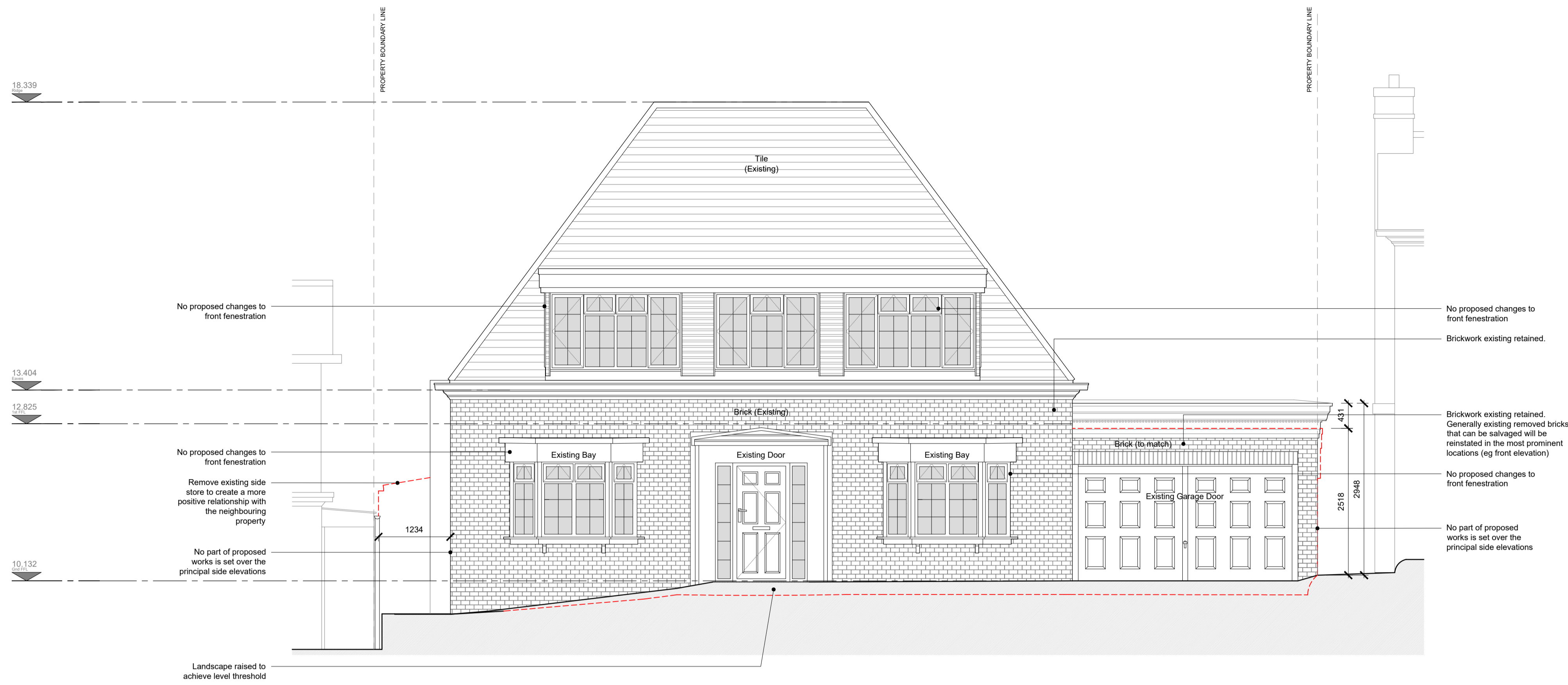
1 Proposed South-East Elevation 1:50 0 0.5 1.0 2.0 3.0 4.0 5.0 Scale in metres