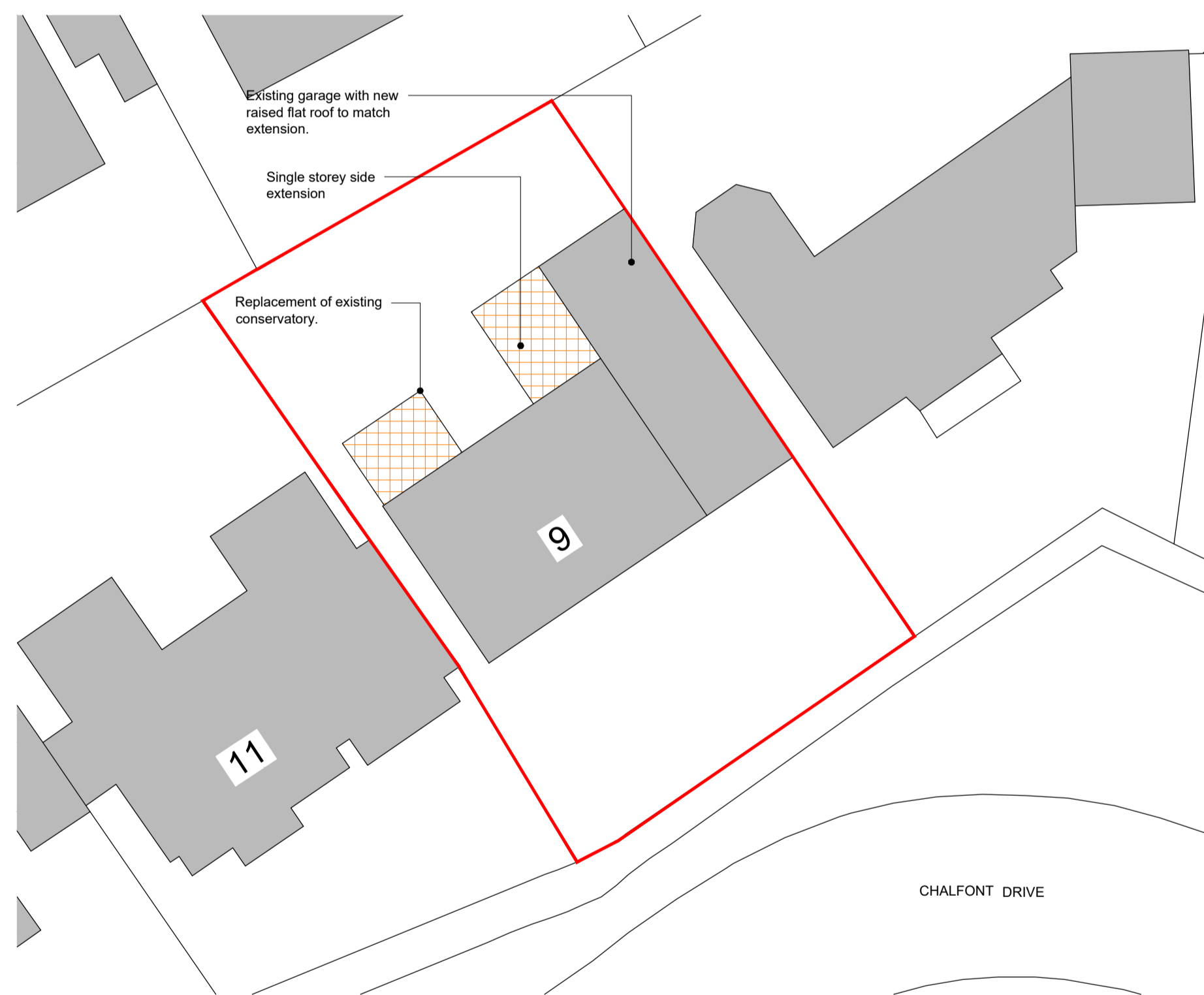
2 Proposed Block Plan Scale 1:200 0 1.0 2.0 5.0 10.0 25.0 Scale in metres