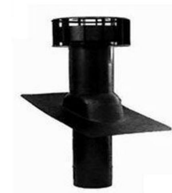
BOILER EXTRACT (120mm Dia black finish)