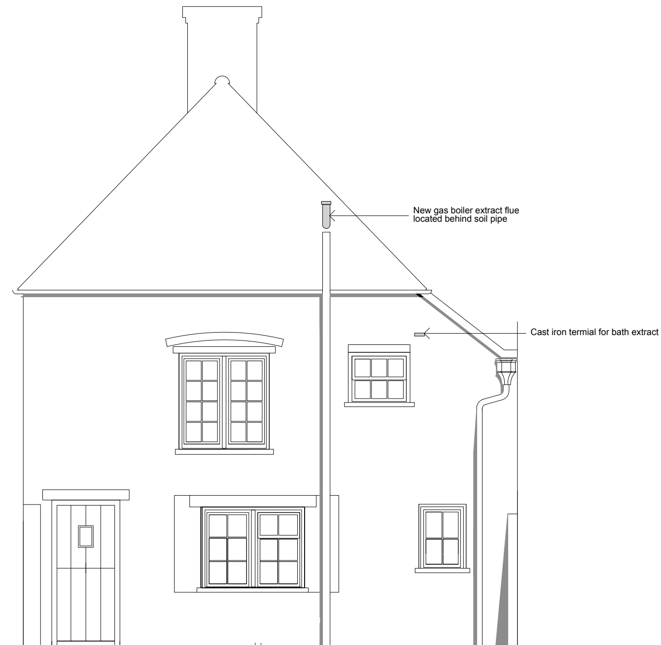
REAR ELEVATION 1/50