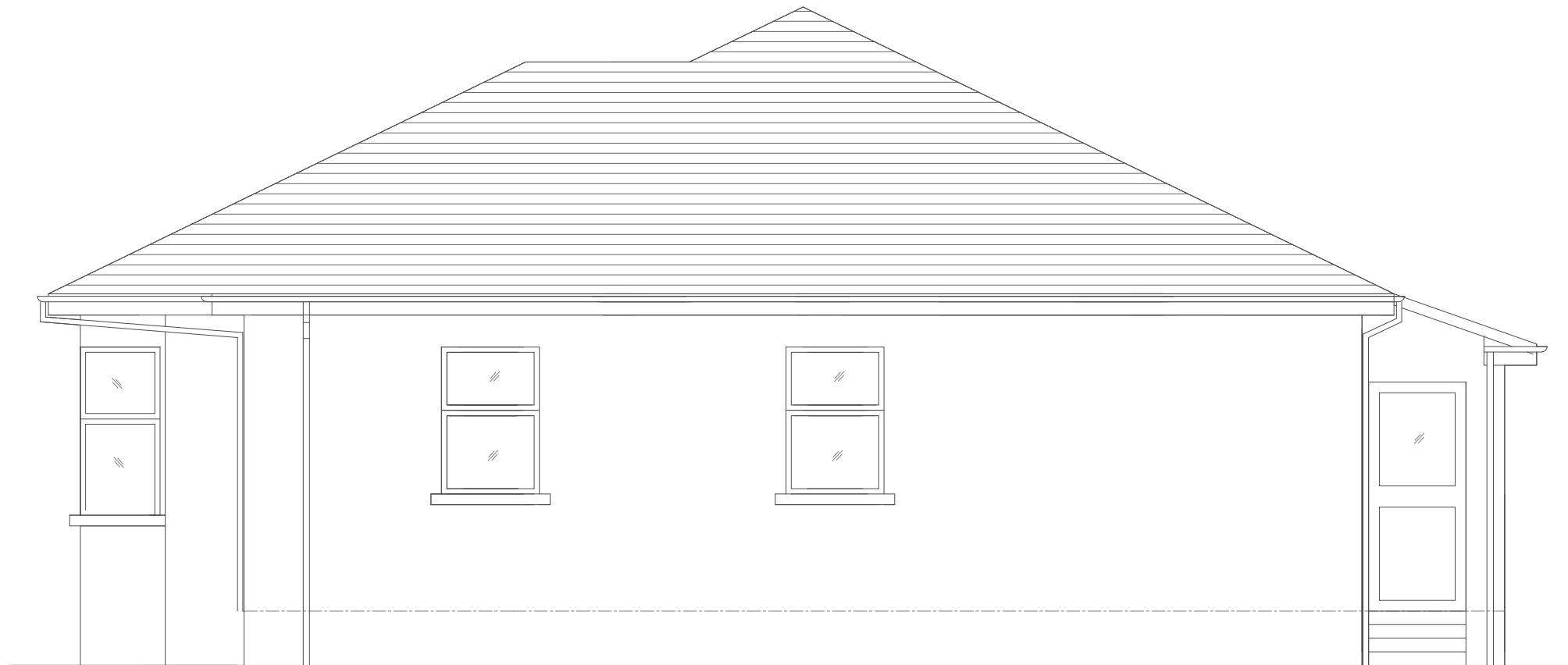
existing side elevation at boundary with neighbouring property

a) it is the contractor's responsibility to check on site all measurements show on these drawings & it is the contractor's responsibility to check on site all measurements prior to ordering or instruct the fabrication of materials.