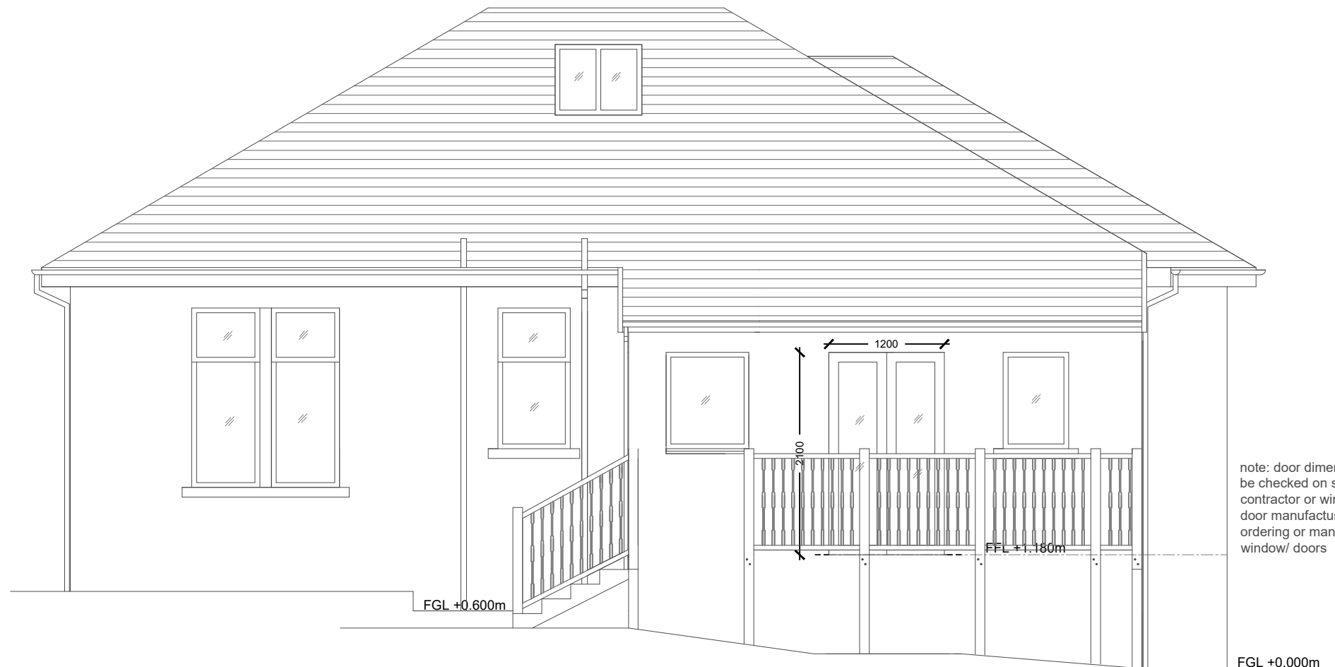
proposed rear elevation

note: door dimensions to be checked on site by contractor or window/door manufacturer prior to ordering or manufacturing window/ doors