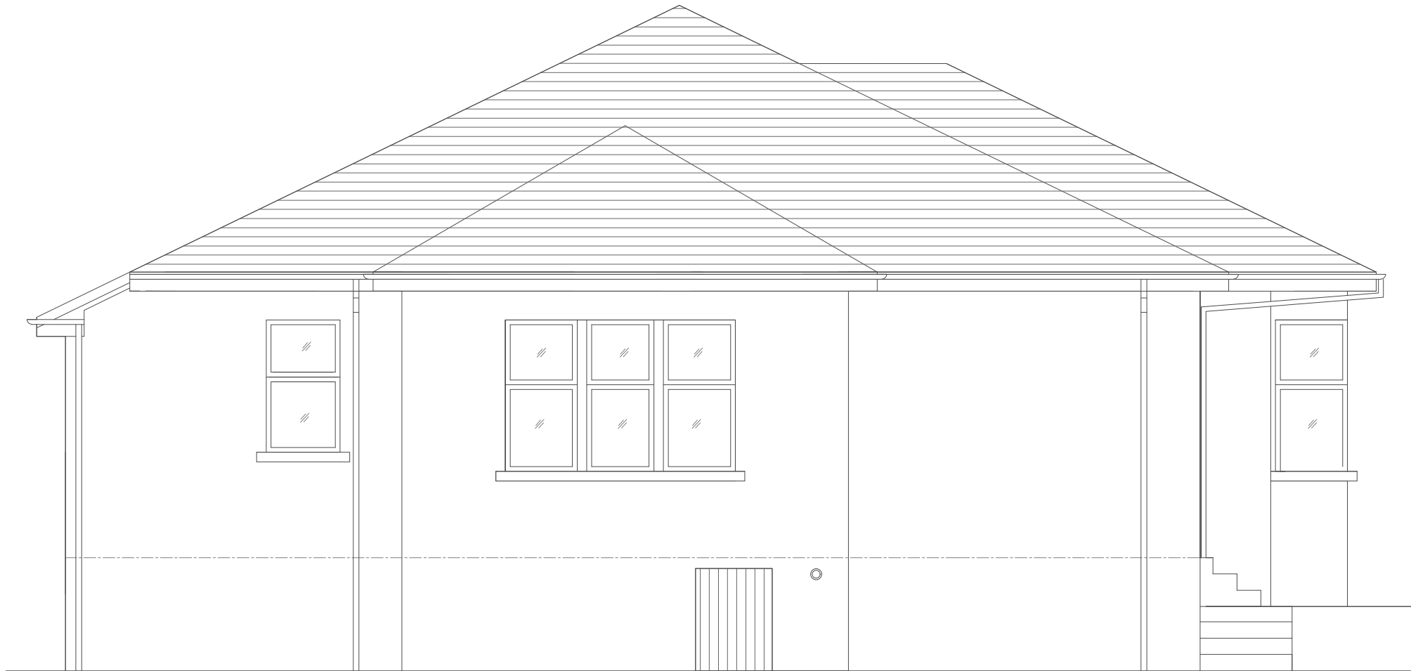
existing side elevation

a) it is the contractor's responsibility to check on site all measurements show on these drawings & it is the contractor's responsibility to check on site all measurements prior to ordering or instruct the fabrication of materials.