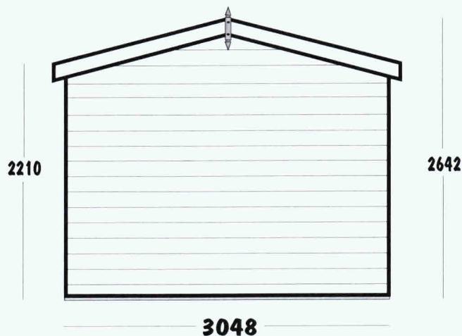
South East Elevation