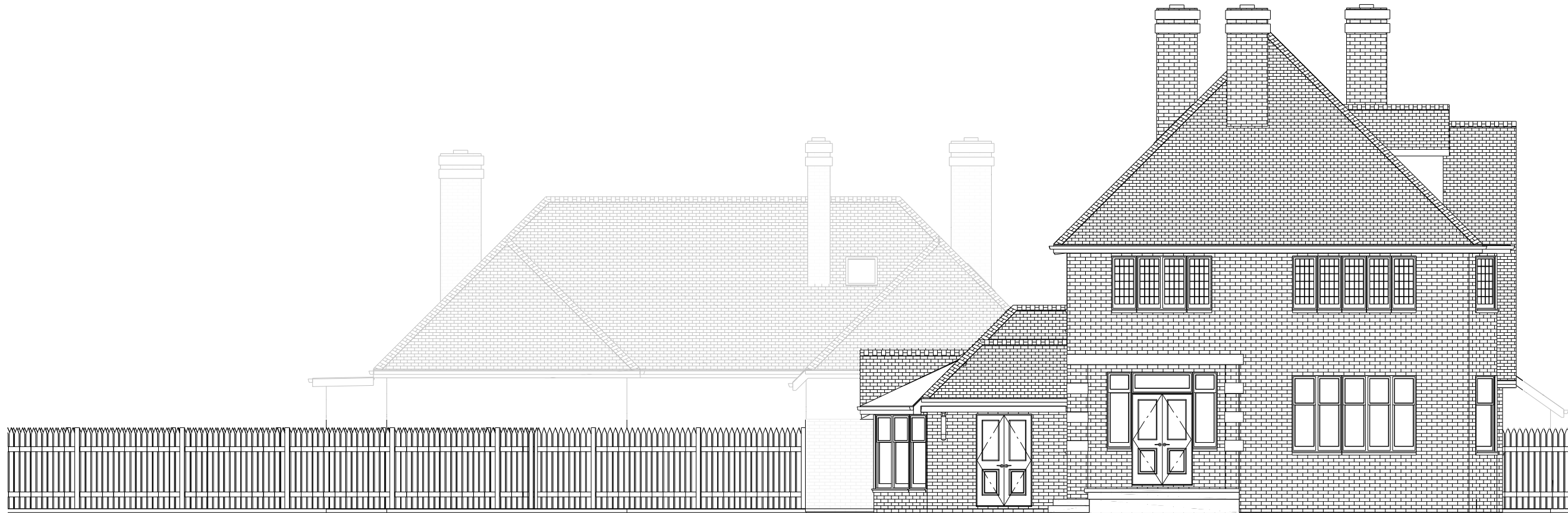
PROPOSED SIDE ELEVATION (LEFT HAND SIDE)