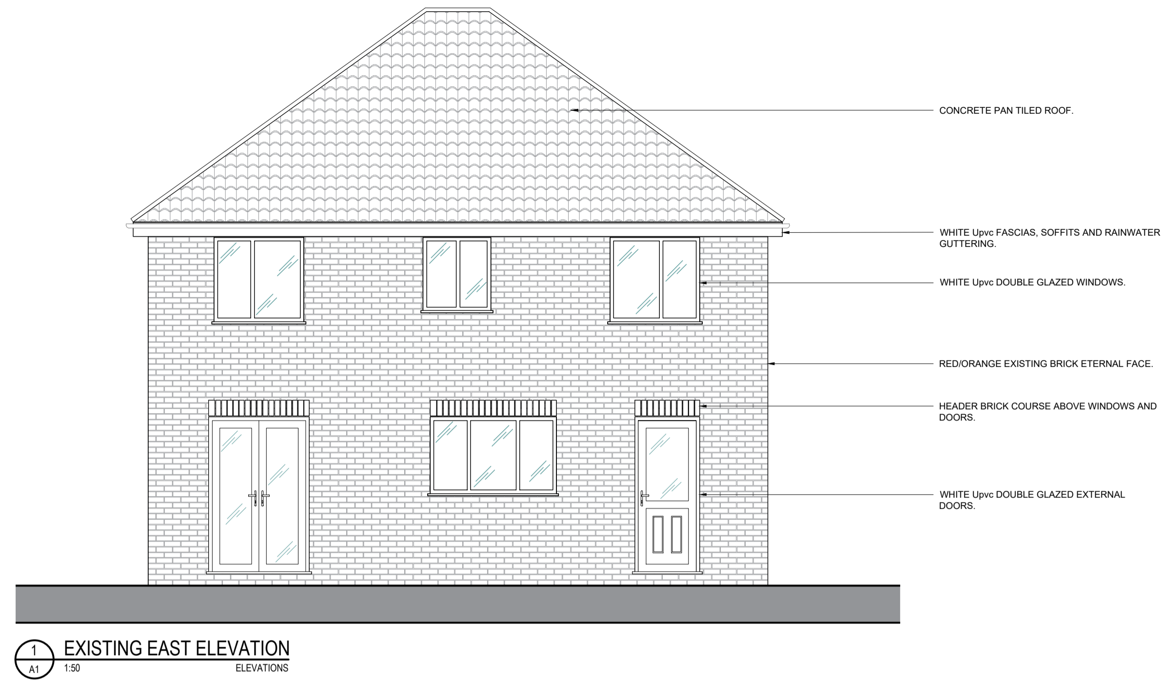
1 A1 1:50 EXISTING EAST ELEVATION ELEVATIONS