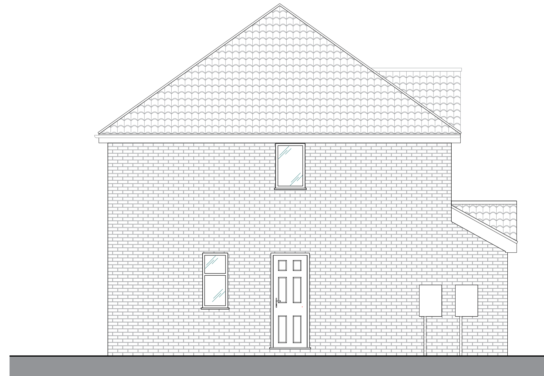
1 A1 1:50 EXISTING NORTH ELEVATION ELEVATIONS

DO NOT SCALE FROM THIS DRAWING. (DRAWING MAY BE SCALED FOR LOCAL AUTHORITY & PLANNING PURPOSES ONLY) ALL DIMENSIONS TO BE CHECKED ON SITE. COPYRIGHT PROTECTED.