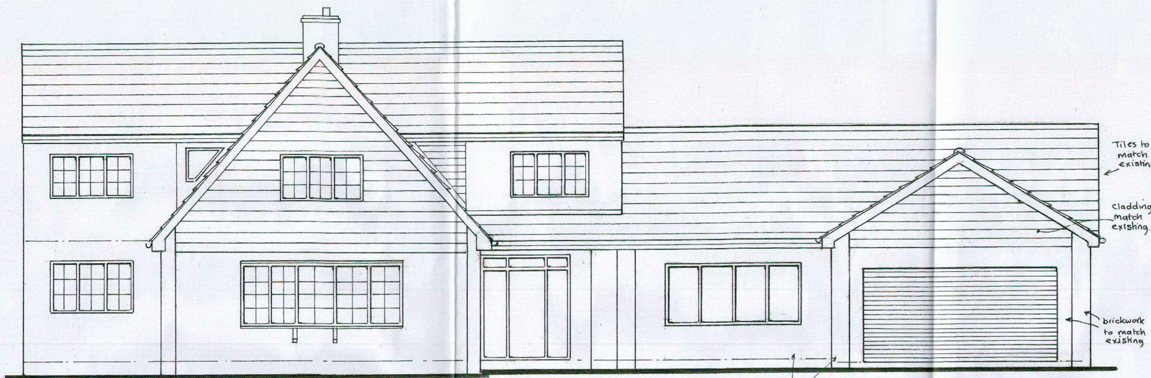
North elevation front