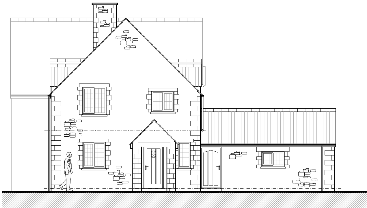
01 NORTH WEST ELEVATION 1:100