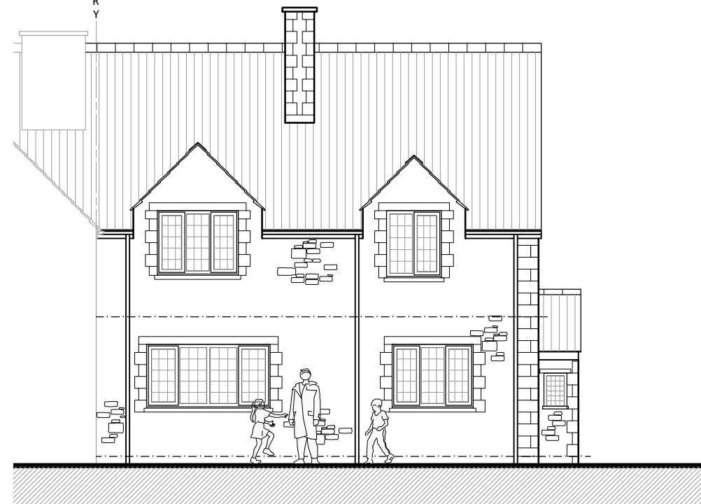
02 NORTH EAST ELEVATION 1:100