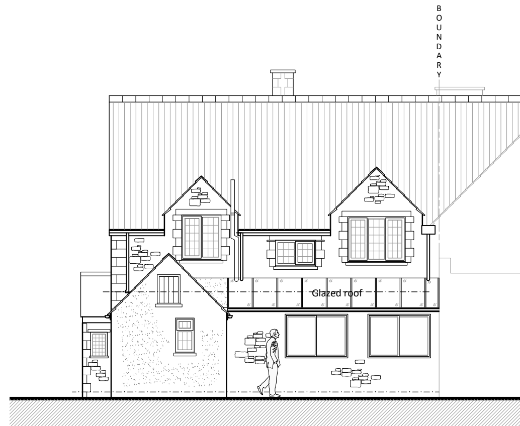
04 SOUTH WEST ELEVATION 1:100