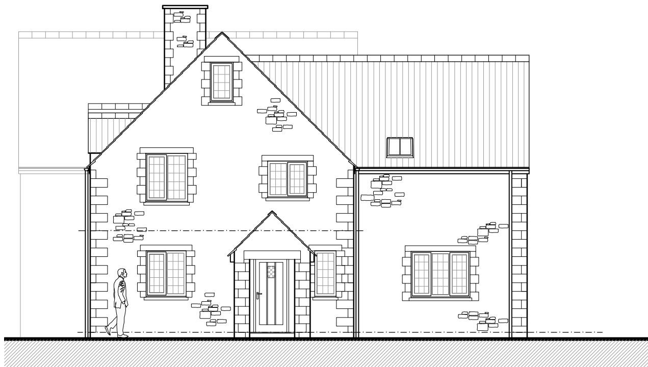
01 NORTH WEST ELEVATION 1:100