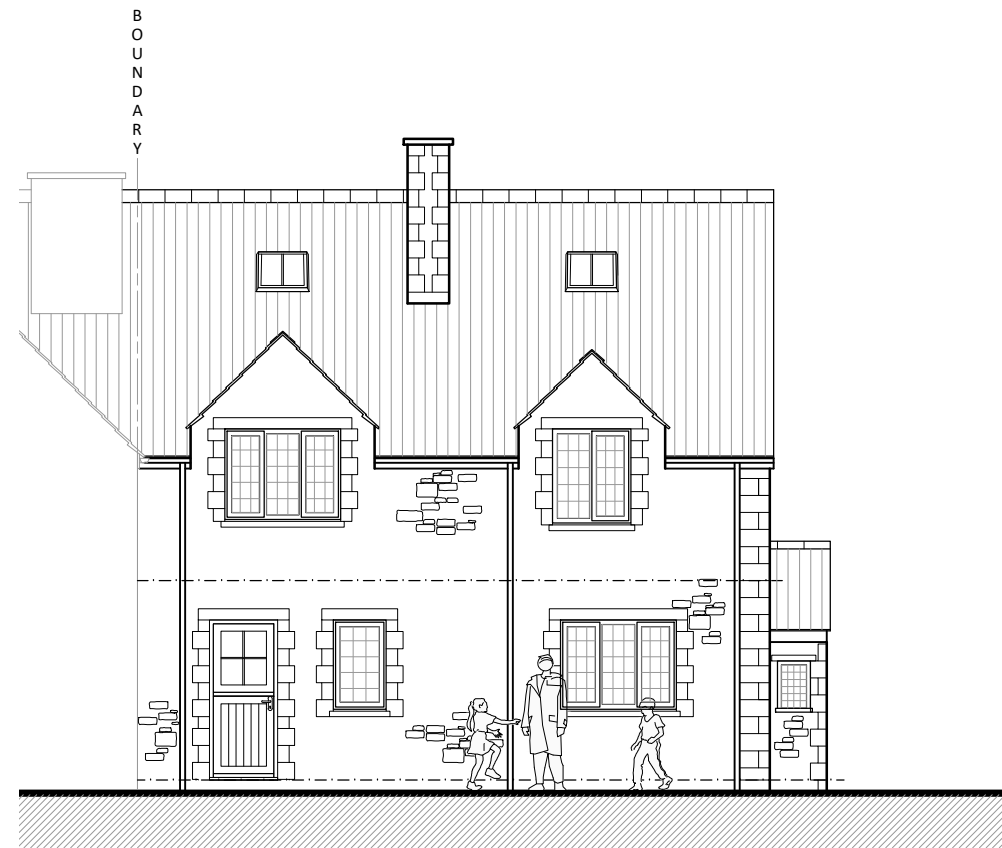
02 NORTH EAST ELEVATION 1:100