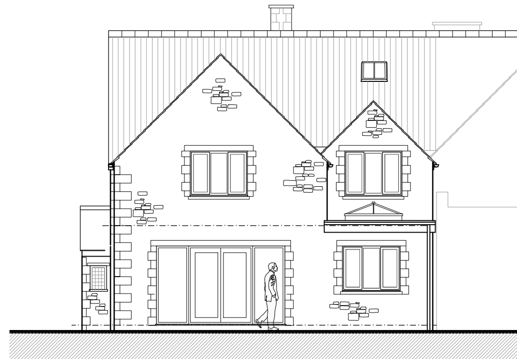
04 SOUTH WEST ELEVATION 1:100

North: OXFORDSHIRE 46 South Bar Street Banbury Oxfordshire OX16 9AB T. 01295 709247 M. 07786 918682 YORKSHIRE 3 New Street York Yorkshire YO1 8RA T. 01904 848868 M. 07706 801879