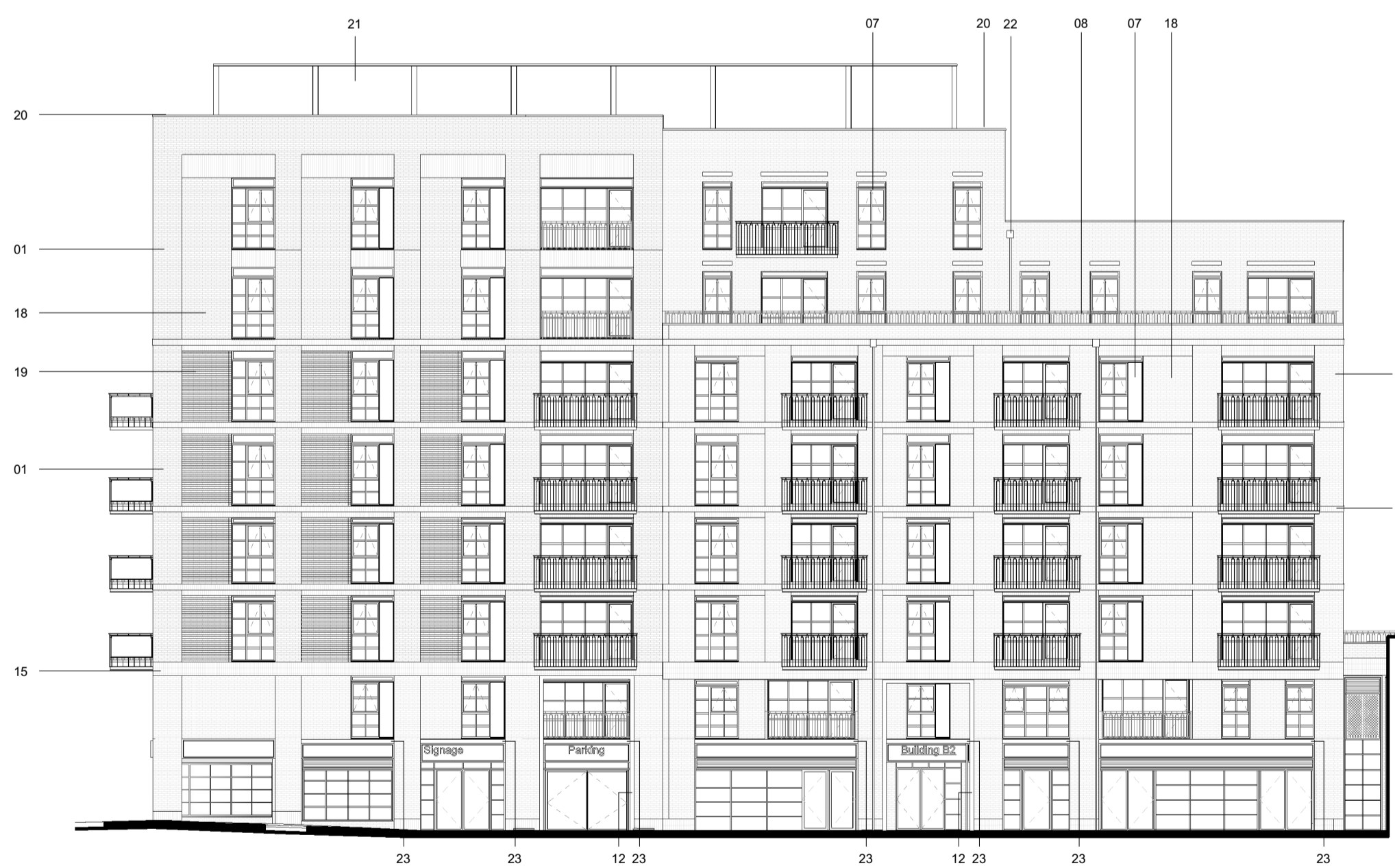
03 Block B2 facing the public square 1 : 200