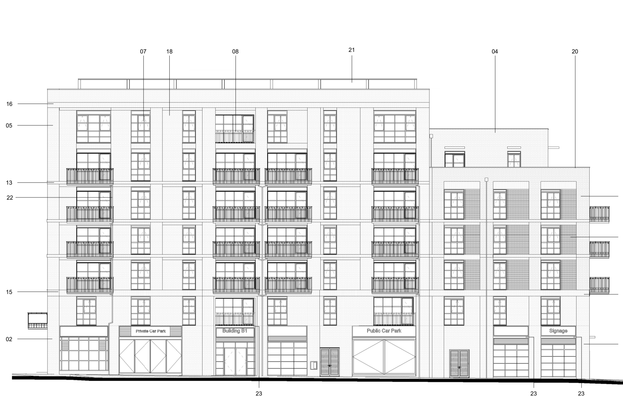
01 Block B1 along Madeira Rd 1 : 200

All intellectual property rights reserved.