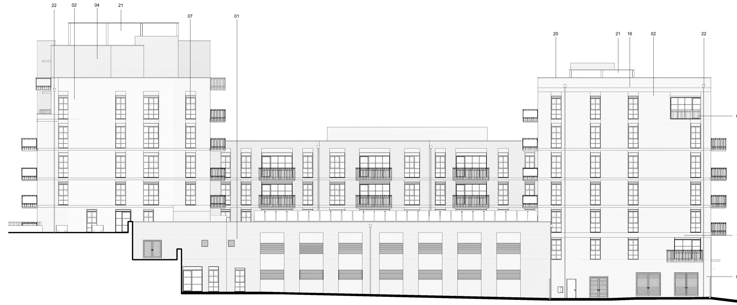
04 Block B facing Raleigh House, Rhino House, Manor House & Magna West 1 : 200