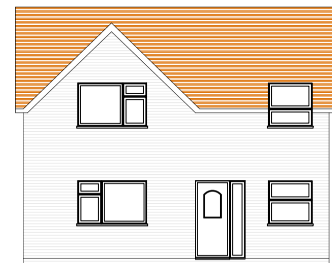
Proposed elevation One - 1:100