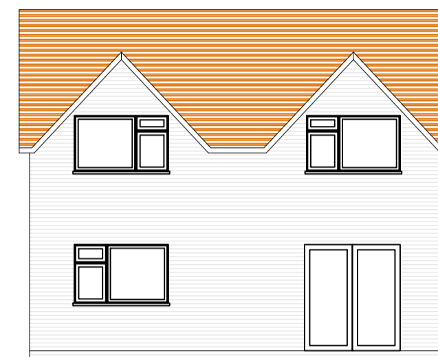
Proposed elevation Three - 1:100