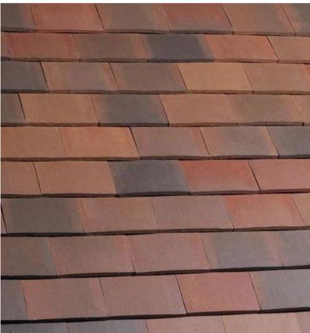
Double chamber clay tiles. Colour ref.: Smooth Brindle or equivalent