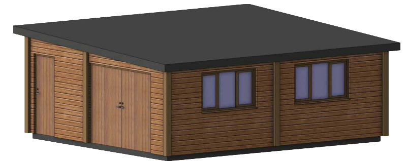
3D VIEWS (1:100)