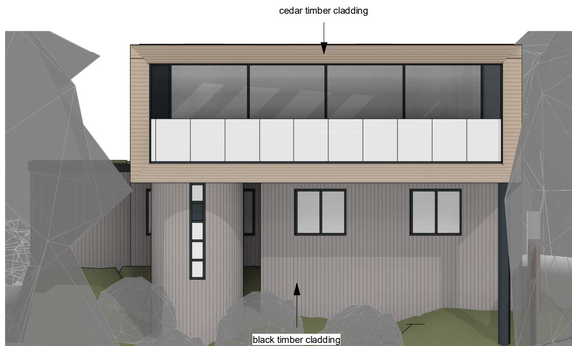
3 CH - North Elevation 1 : 100