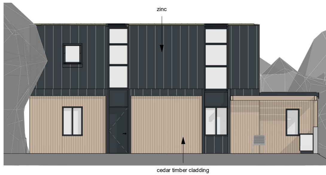
1 CH - South Elevation 1 : 100