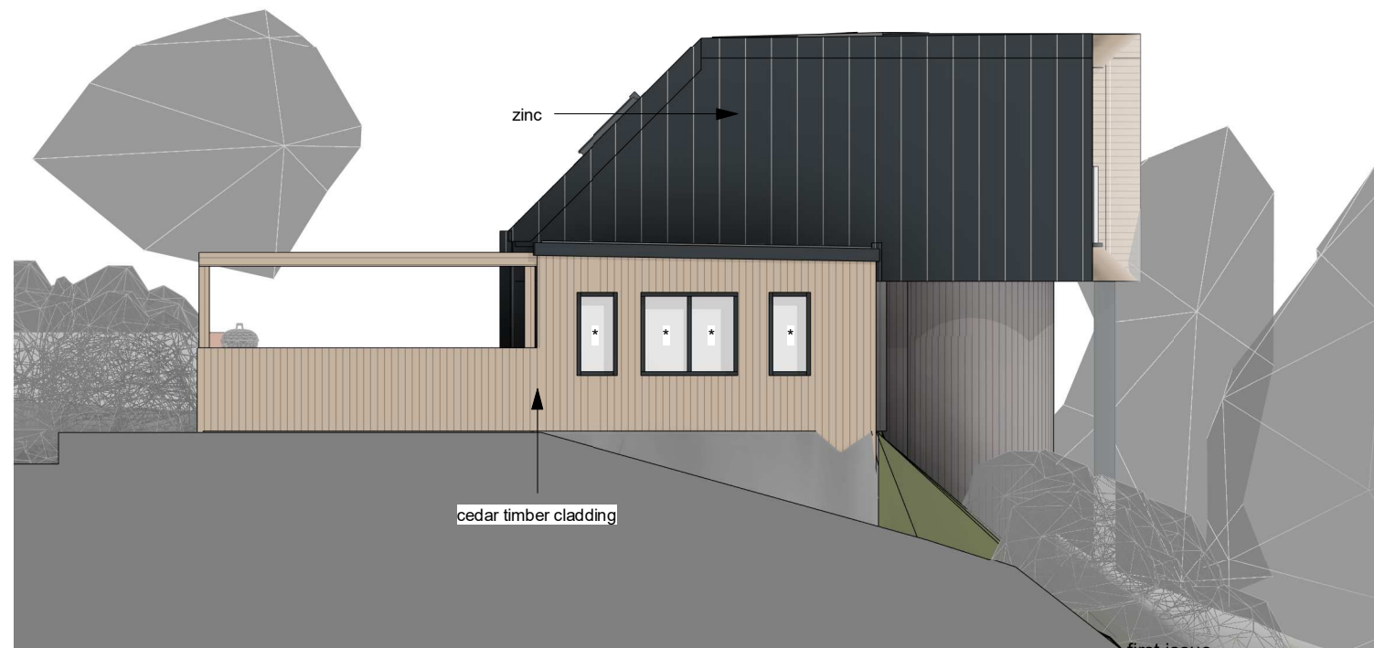
4 CH - East Elevation 1 : 100