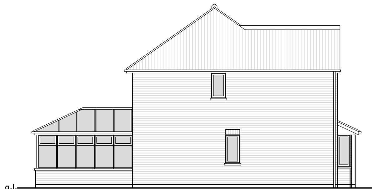
EXISTING SIDE ELEVATION EAST