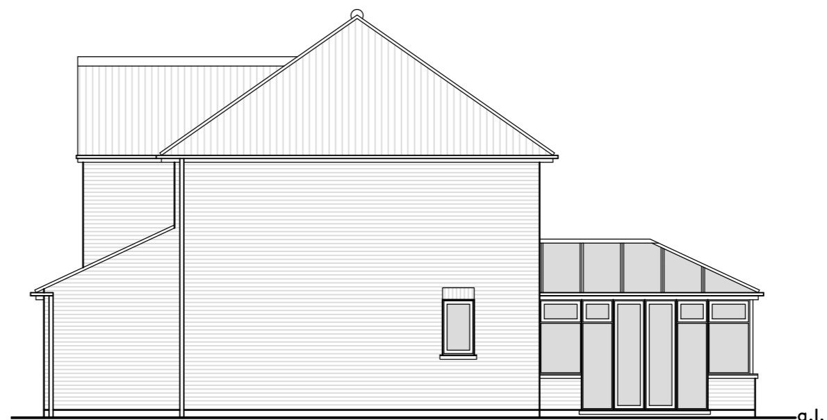
EXISTING SIDE ELEVATION WEST