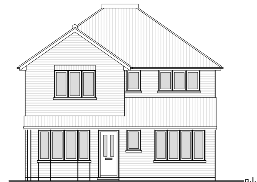
EXISTING FRONT ELEVATION NORTH