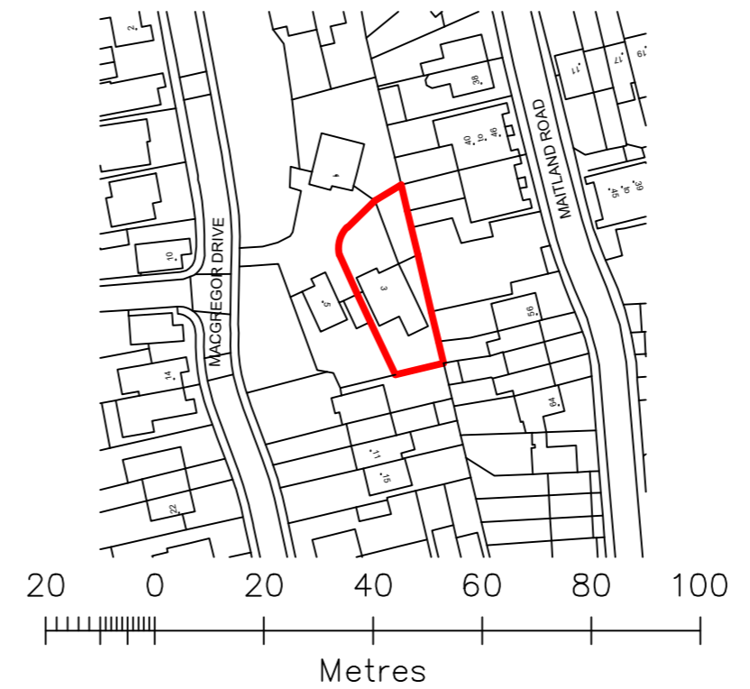
LOCATION PLAN SCALED 1:1250 APPLICATION SITE OUTLINED IN RED