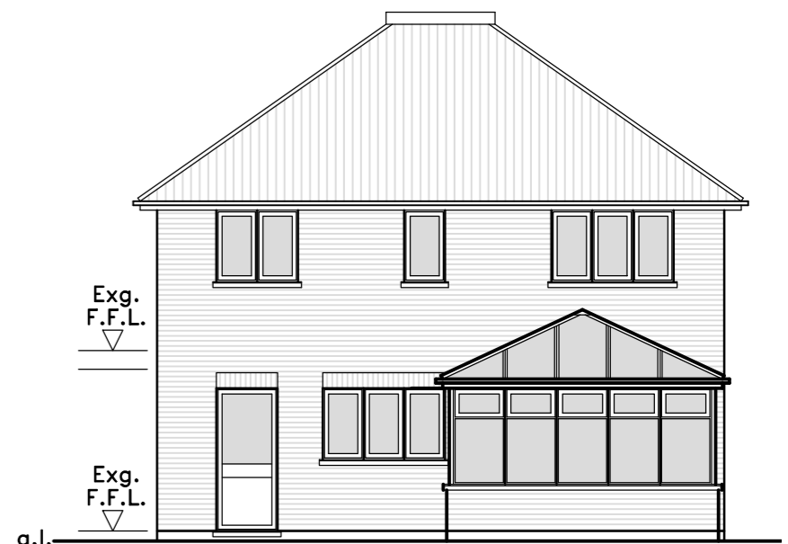
EXISTING REAR ELEVATION SOUTH