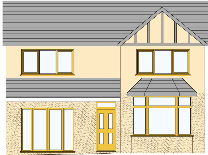
Front Elevation (West)