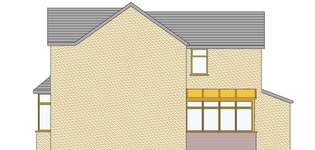
Flank Elevation (South)