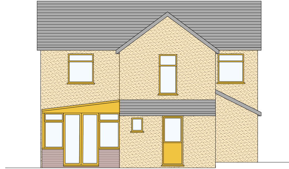
Rear Elevation (East)