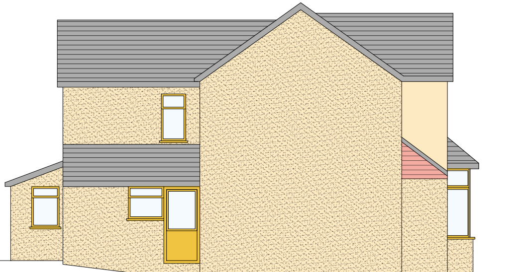
Flank Elevation (North)