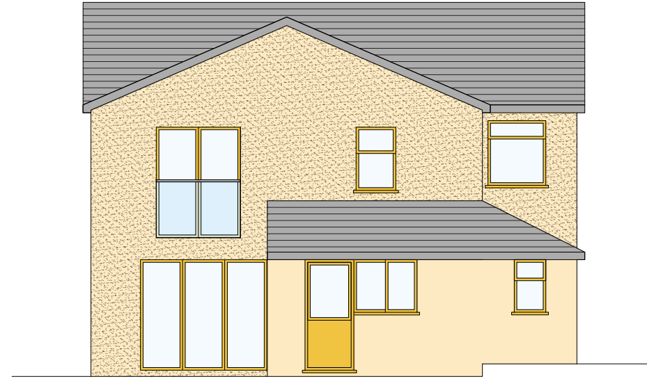
Rear Elevation (East)