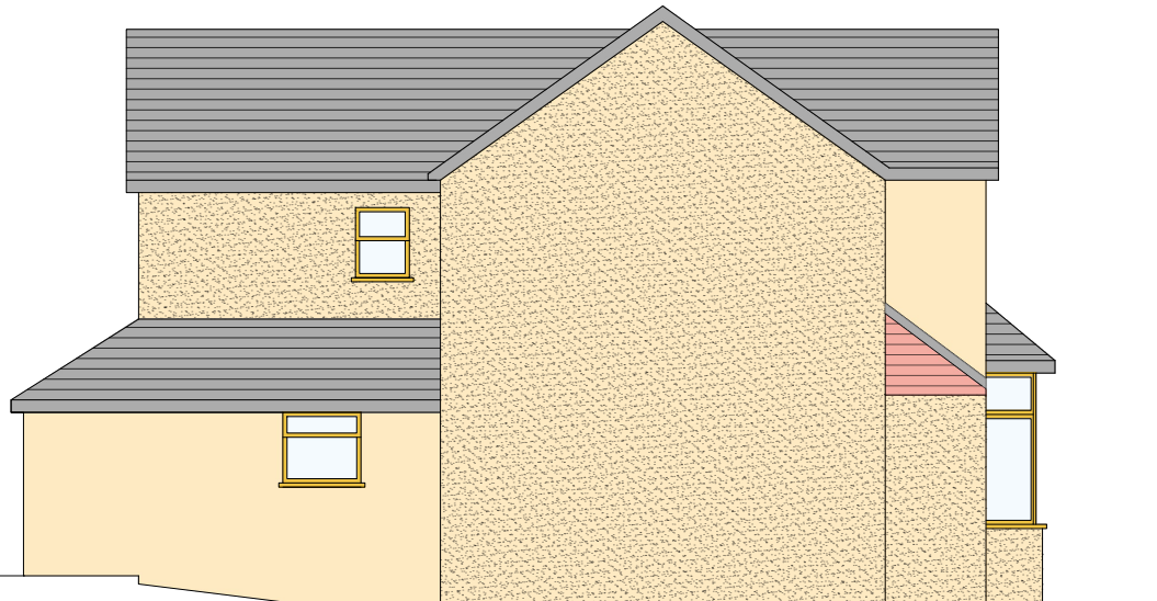
Flank Elevation (North)