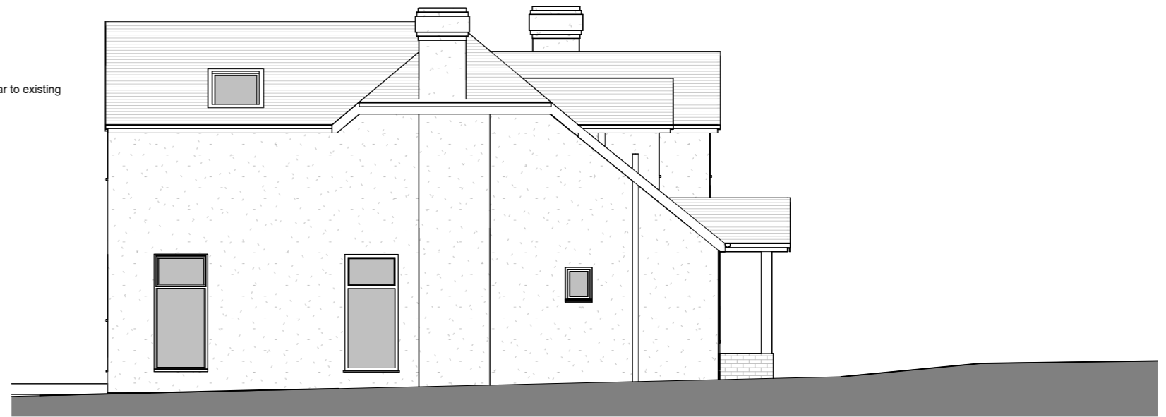
Side 1 Elevation