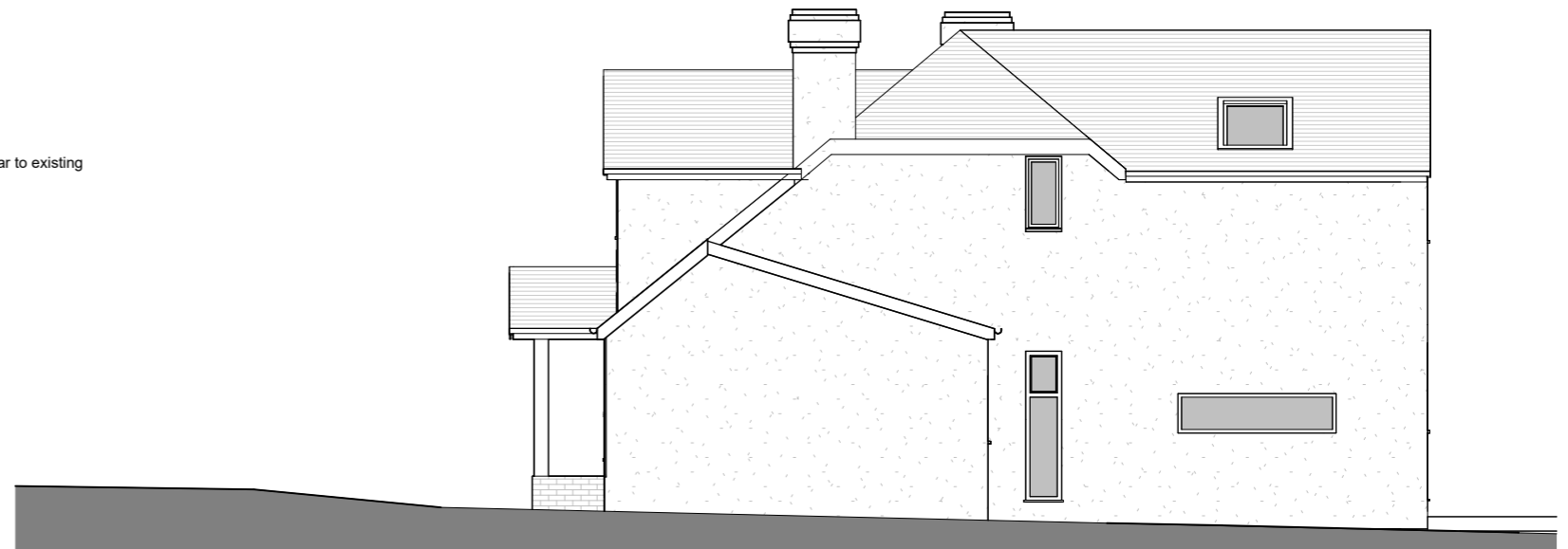
Side 2 Elevation