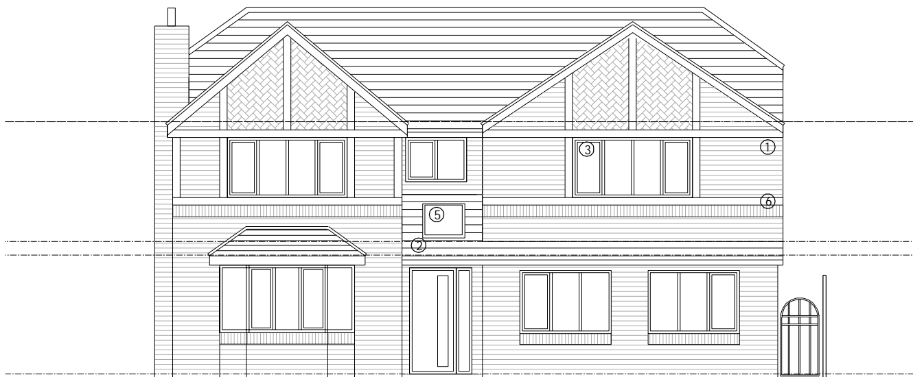
proposed front elevation