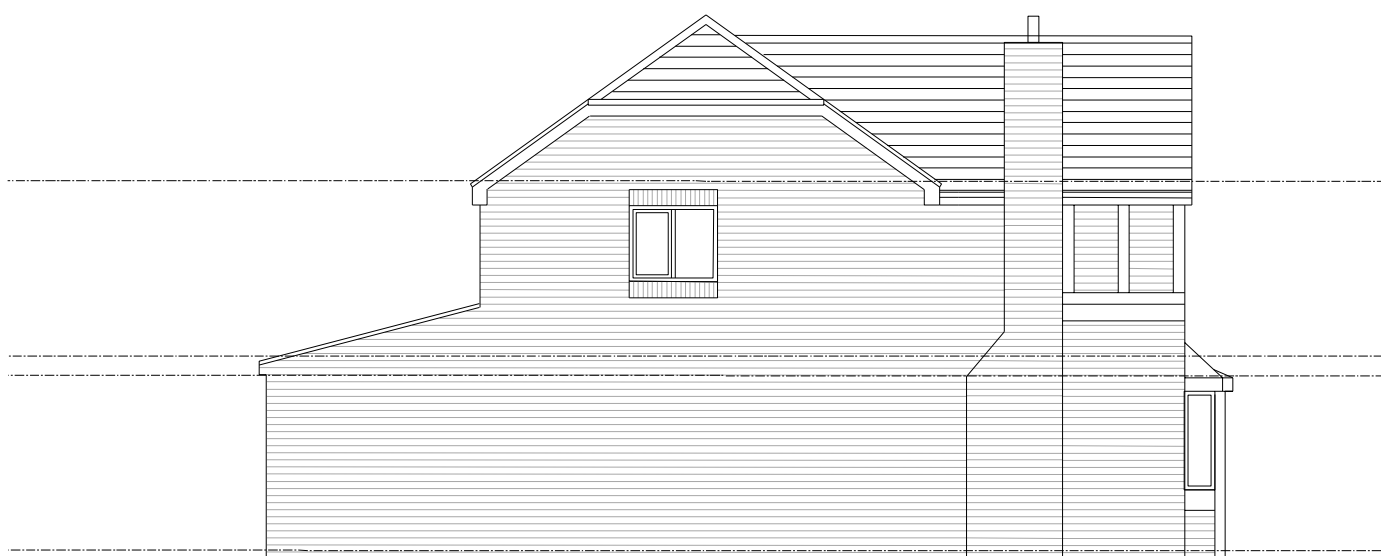
proposed side elevation