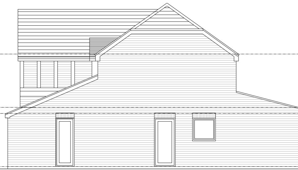
existing side elevation