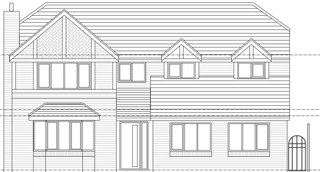
existing front elevation