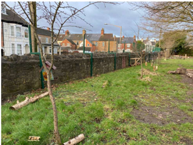
Photograph 3 – Westfield Lane Boundary