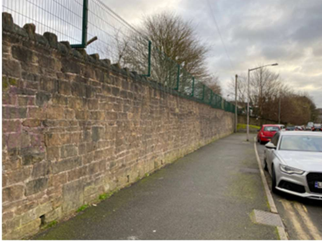
Photograph 1 – Westfield Lane Boundary