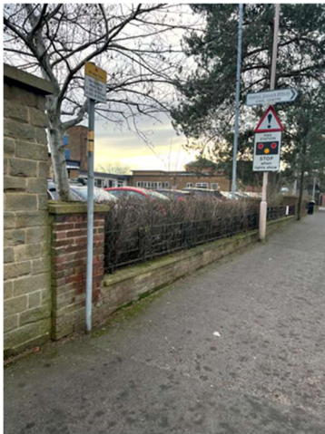
Photograph 5 – Low perimeter railings do not prevent access