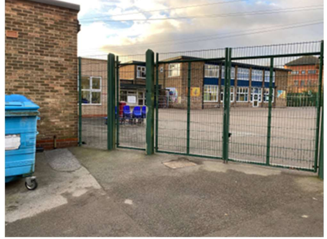
Photograph 2 – Car Park / Playground boundary