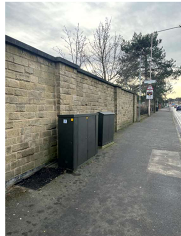
Photograph 4 – Comms boxes aid wall climbing