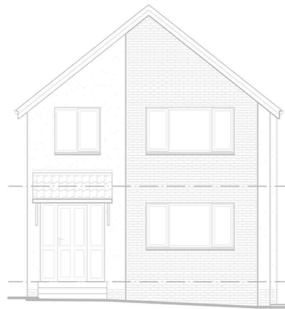
Existing South-East Elevation