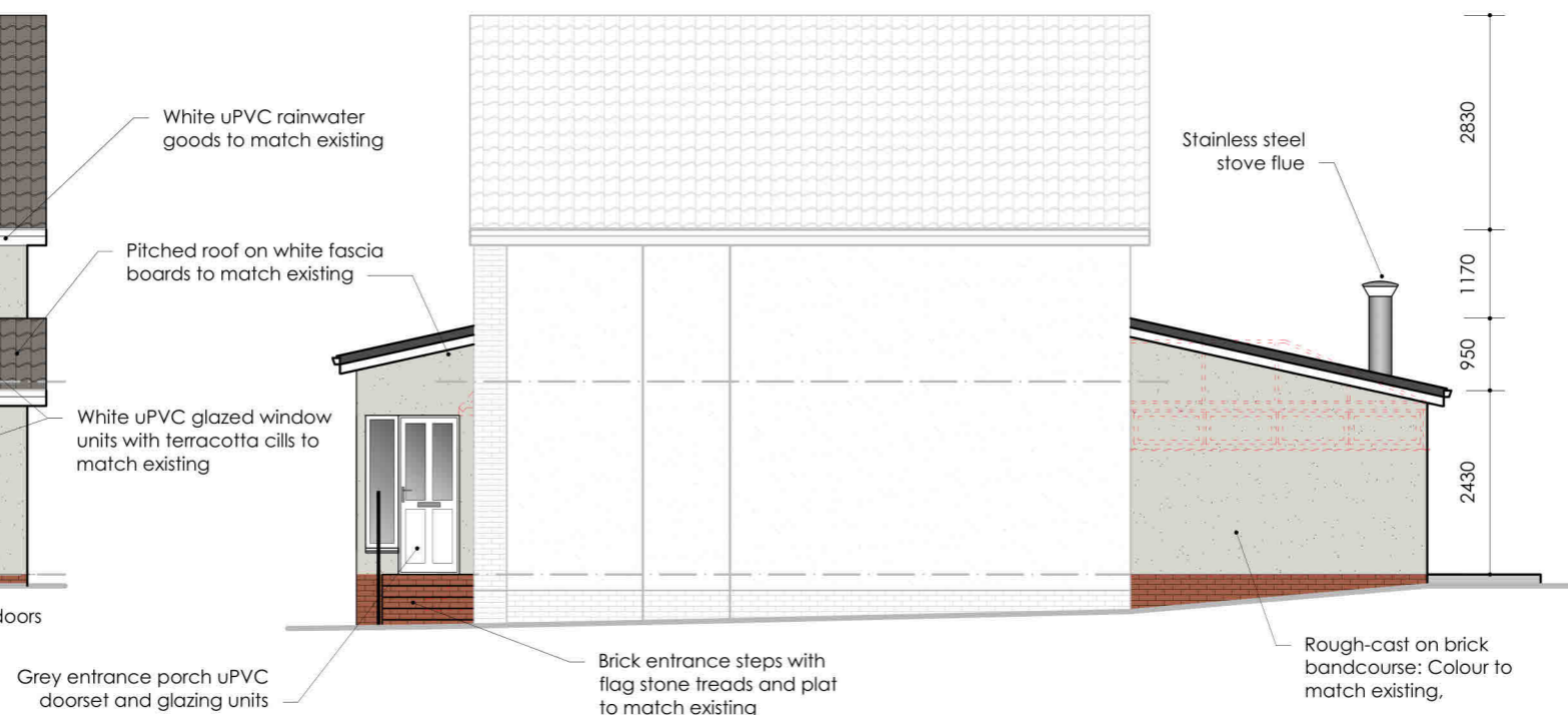
Proposed North-East Elevation