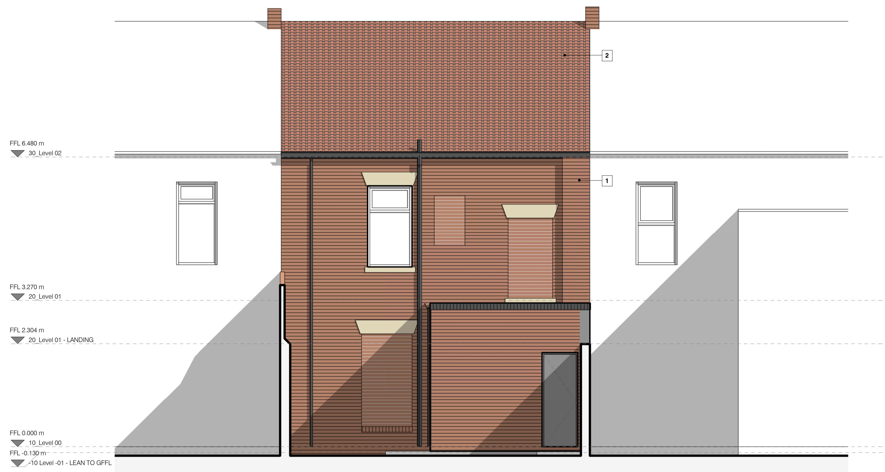
C - EXISTING REAR ELEVATION 1 : 50