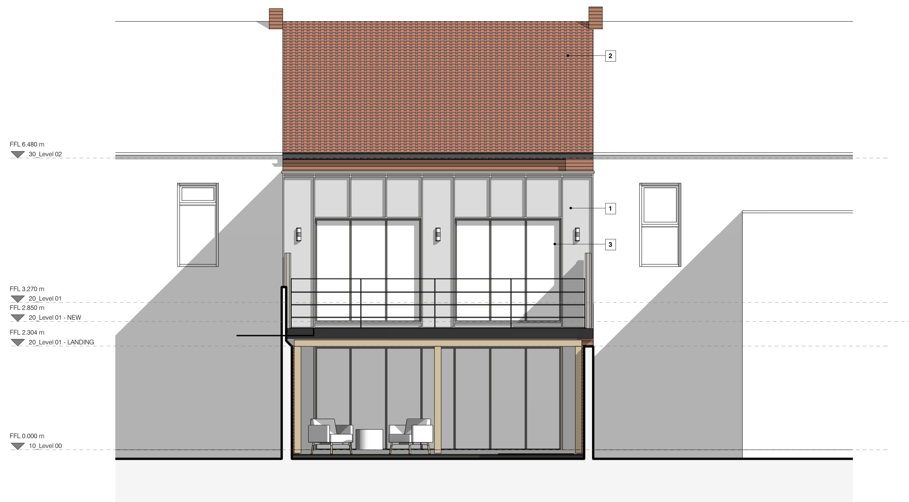
C - PROPOSED REAR ELEVATION 1 : 50