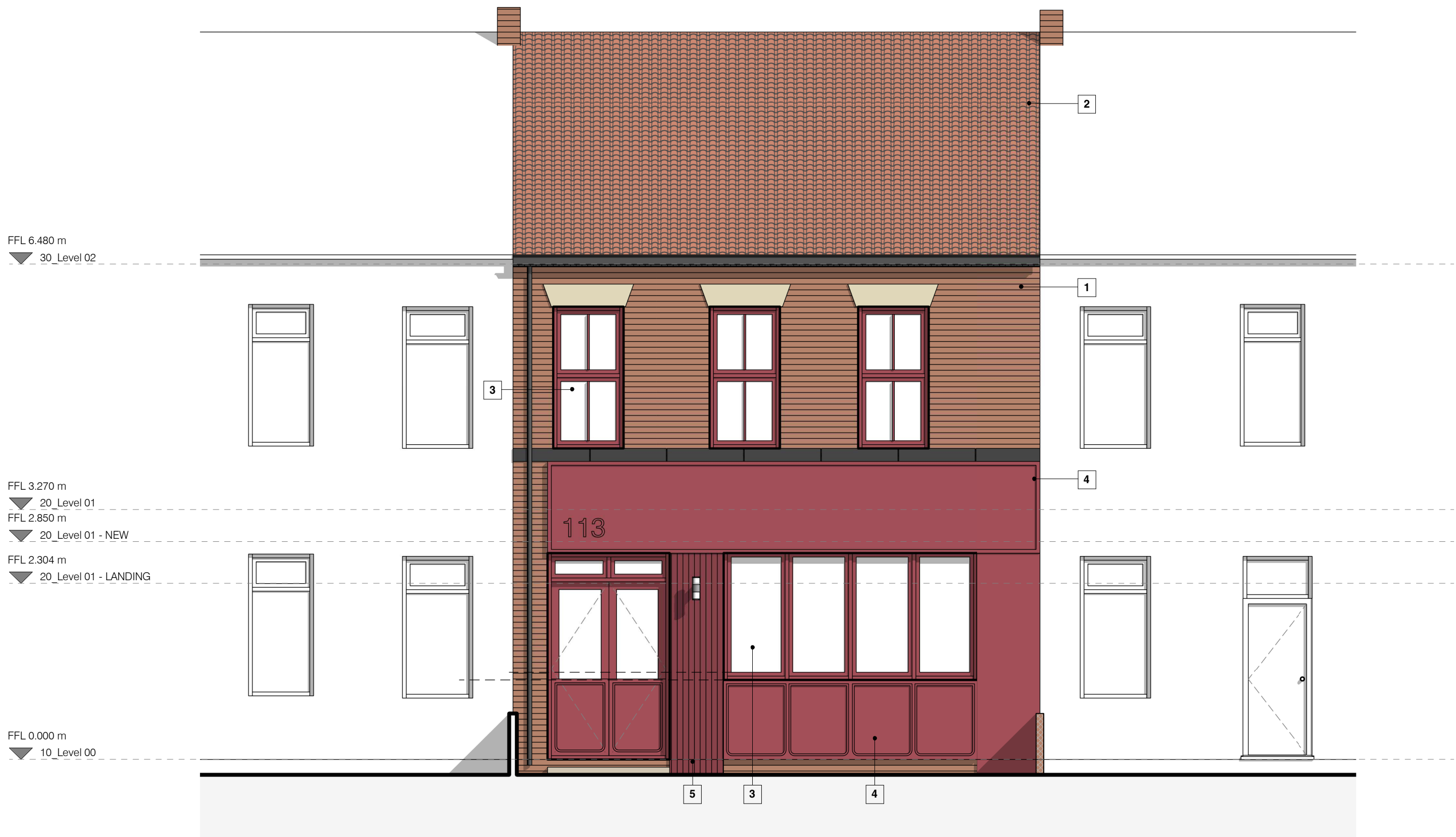
A - PROPOSED FRONT ELEVATION 1 : 50