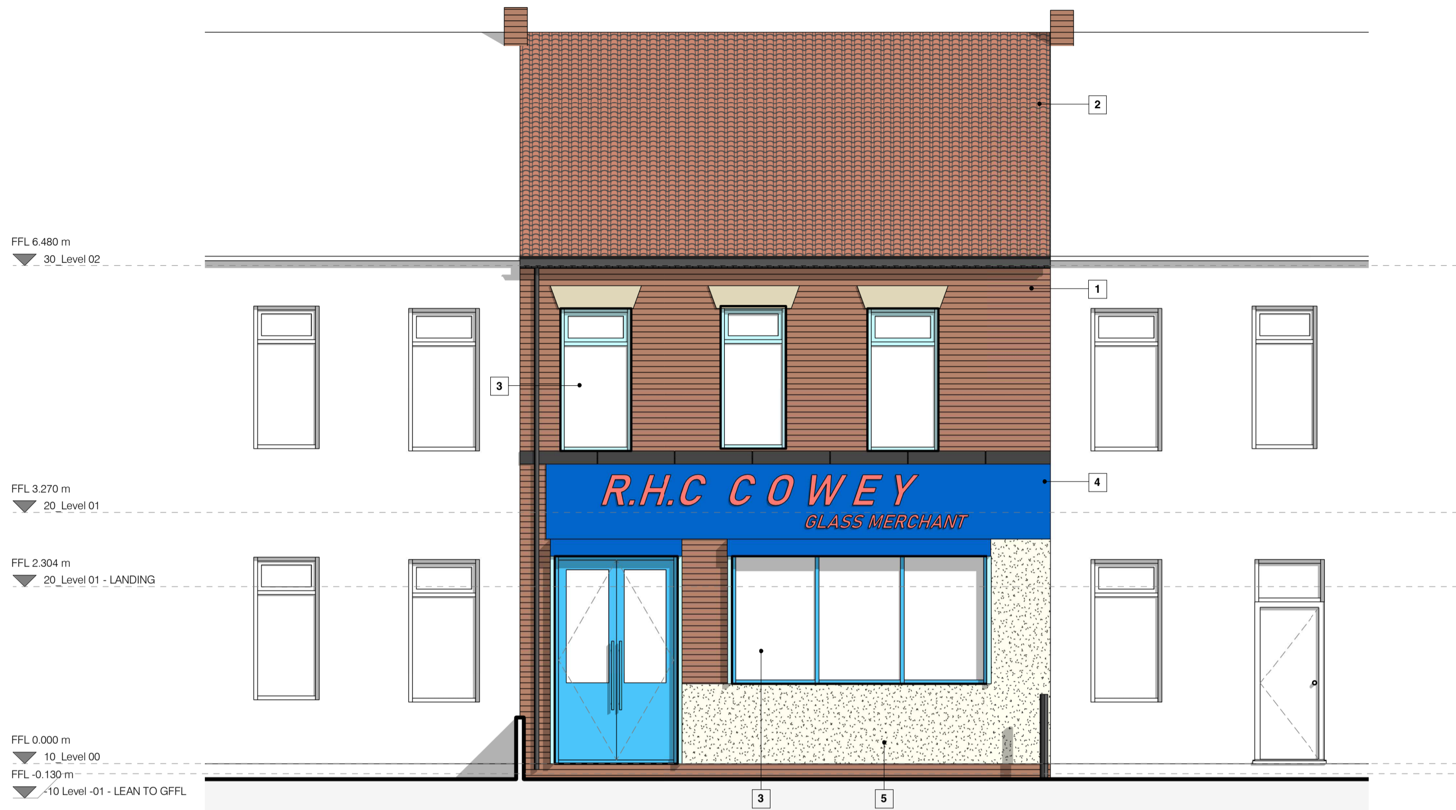
A - EXISTING FRONT ELEVATION 1 : 50