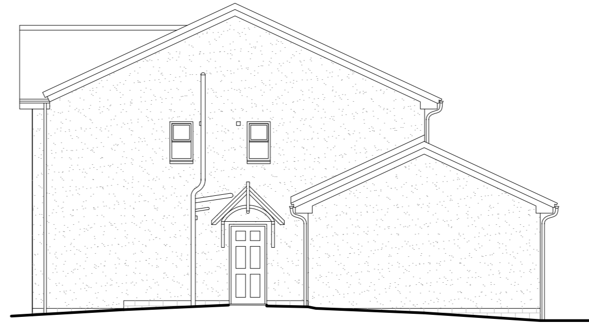
Side Elevation as Existing Scale 1:50