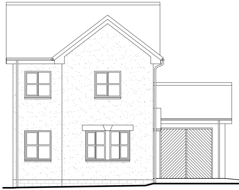
Front Elevation as Existing Scale 1:50