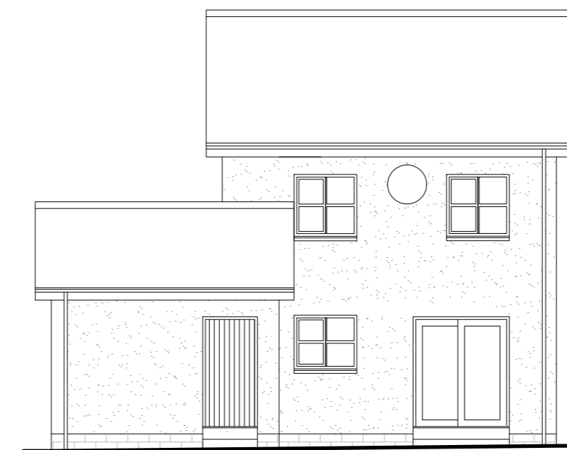
Rear Elevation as Existing Scale 1:50

rm architecture ltd Bloomfield, Heatherlie Park, Selkirk, TD7 5AL tel: 01750 21709 email: rmarchitecture4@gmail.com