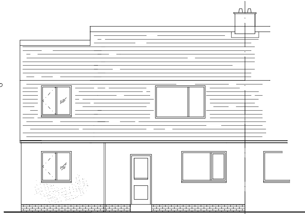
Front Elevation As Proposed

New UPVC windows colour and style to match exist.