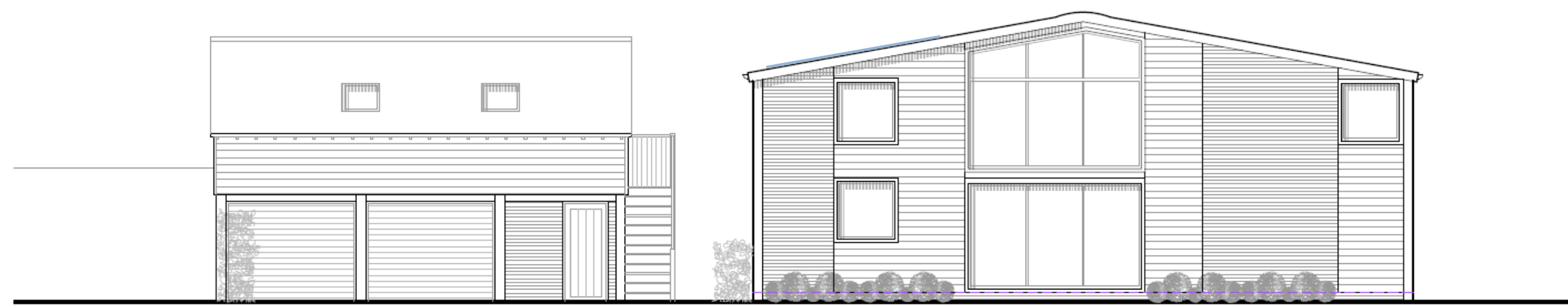
Proposed East Elevation Scale 1:100