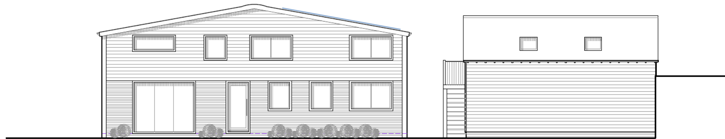
Proposed West Elevation Scale 1:100